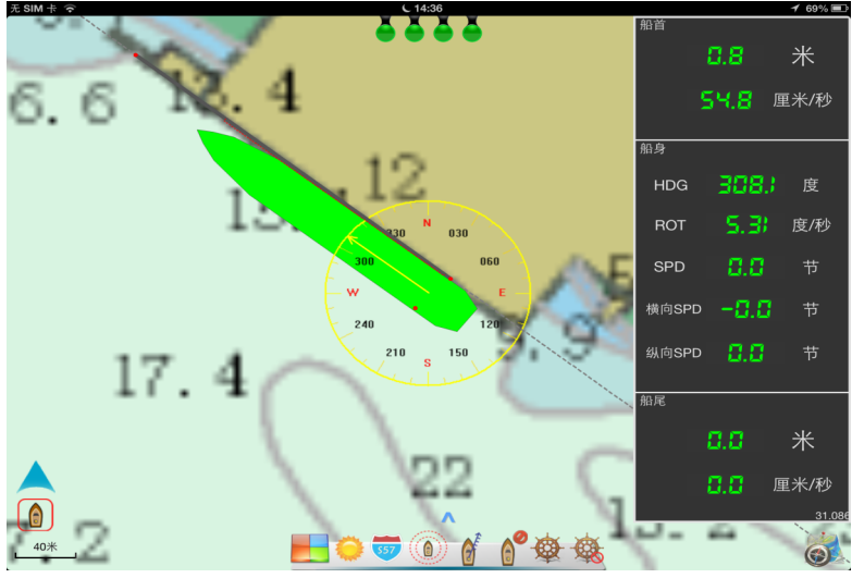
Fig. (4). Displaying interface.

The design of the software system has the following functions: