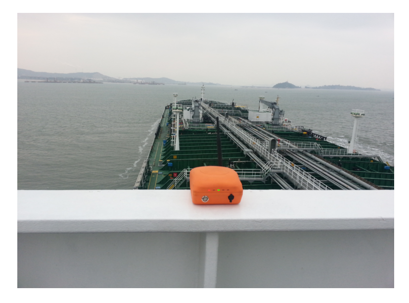
Fig. (3). Pilot process.