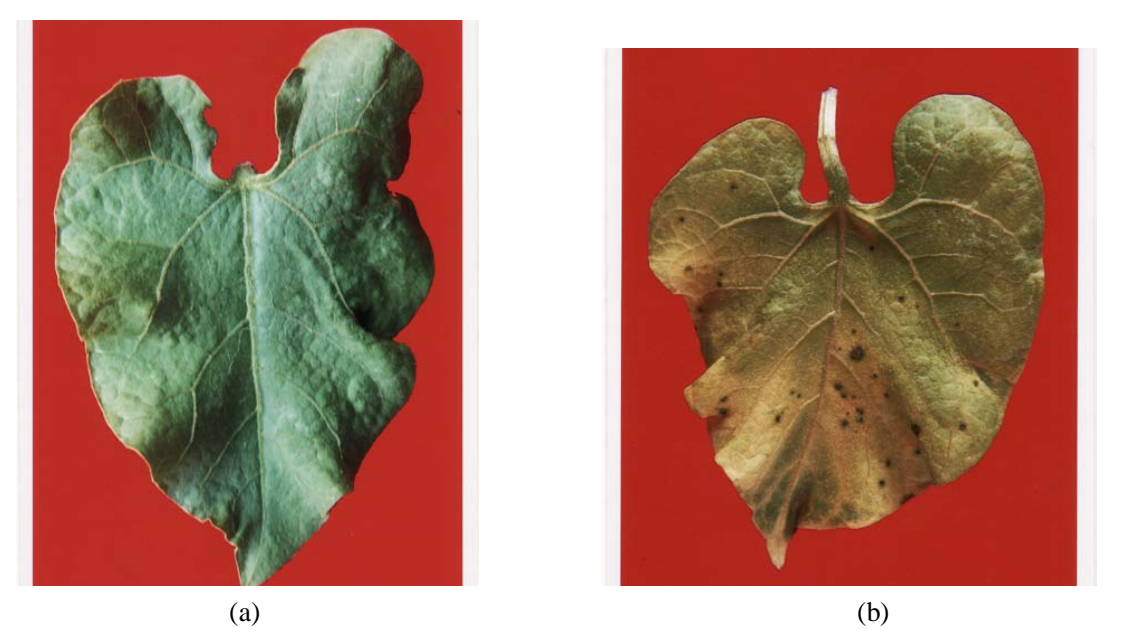
Fig. (2). Necrotic local lesions observed in Phaseolus vulgaris when inoculated with extracts of symptomatic leaves of Kinnow plants (a) Control (b) Infected leaf.

ICRSV. Local necrotic lesions were observed only in leaves of C. amaranticolor and P. vulgaris (Figs. 1 and 2). However earlier studies reported that ICRSV could not be transmitted by mechanical inoculations on herbaceous hosts and by some citrus cultivars [2, 20].