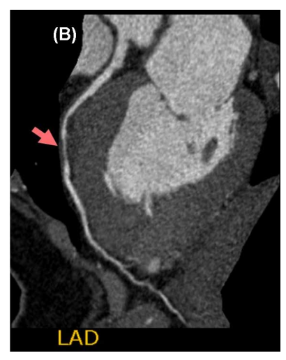
Fig. (1). B: MDCT coronary angiography shows non-calcified plaque with significant LAD stenosis (arrow) after sublingual nitroglycerine.

Fig. (1). A: MDCT coronary angiography shows calcified plaque with significant LAD stenosis (arrow). Note that there is also significant left main stenosis.