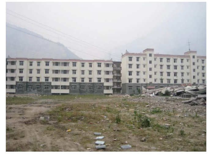
Fig. (4). The teachers' residential building.

Through a lot of analysis to seismic damage, we conclude the major position of seismic damage of different components of multistory masonry structure, as it is showed in Table 5.