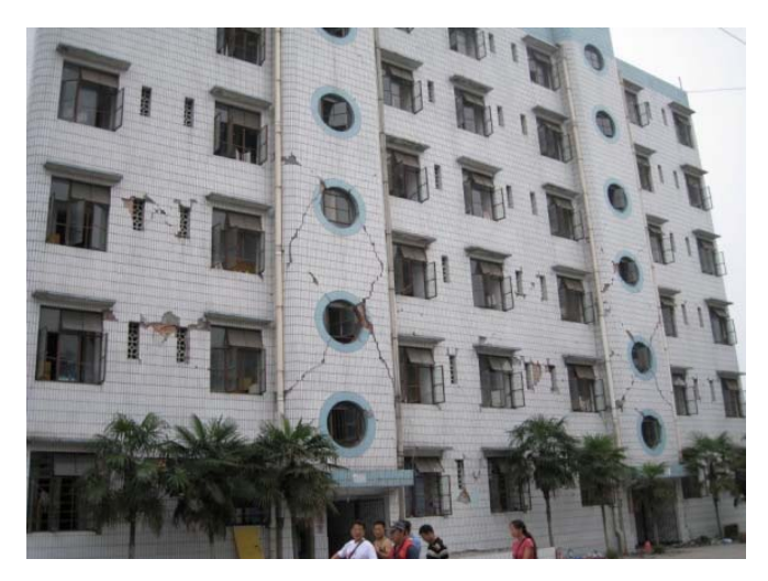
Fig. (2). The dormitory building of Hanwang technology school.

In addition, the previous earthquake damage showed that earthquake damage distribution and the distribution of seismic shear have a certain similarity. An example of Wenchuang earthquake is shown in Fig. (2), it's a male dormitory building of Hanwang technology school in Deyang, and its mass and stiffness are uniformly distributed along the height. According to the field survey, the building's seismic damage gradually became less from the bottom floor, until the top floor was not significantly damaged, the seismic damage distribution has obvious regularity.