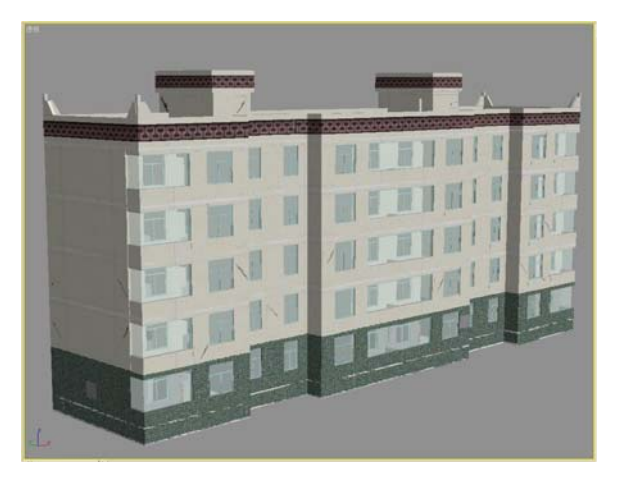
Fig. (5). Slightly damage model of the teachers' residential building.