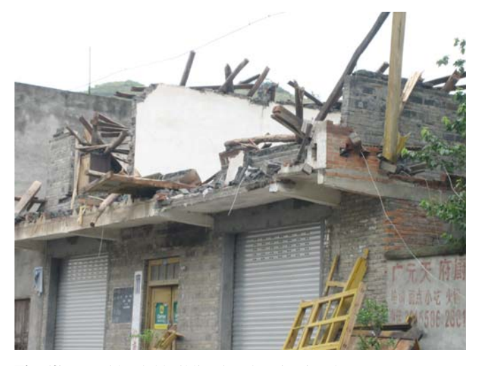
Fig. (3). A residential building in Qingxi, Qingchuan county.

In the Wenchuan earthquake, some buildings had weak floors, and these floors often had more serious damage, and other floors were less damaged, the reason was that when the weak floors were badly damaged, they produced energy dissipation and disaster mitigation effect, and reduced the damage of other floors. As shown in Fig. (3), it's a residential building in Qingxi, Qingchuan county of Guangyuan city, the top floor of this building is weak, the top roof was caved in the earthquake, the walls were out of plane collapsed, but the bottom had no obvious damage.