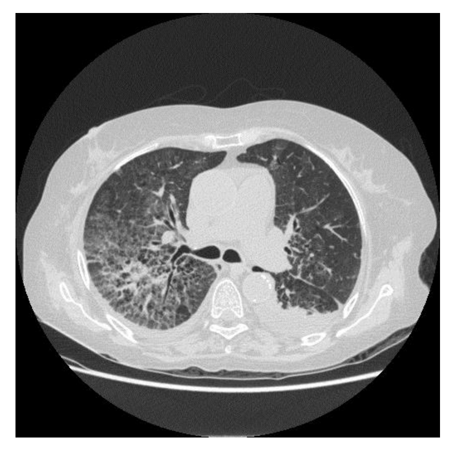
Fig. (1). CT scan of Chest showing patchy opacification and bilateral pleural effusion.

In November 2016, a new CT scan evaluation was performed where she maintained stable disease. The treatment with Nivolumab was reassumed (19° cycle) and soon after, she was admitted to hospital with a 5-day history of progressive dyspnea without cough, expectoration or fever. On admission, she was afebrile, with normal blood pressure (125/63 mmHg) and cardiac rhythm (79 beats/min). Her respiratory rate was 24 breaths/min, with an oxygen saturation of 88% by pulse oximetry while breathing room air and 93% while receiving supplementary oxygen at a flow of 4 liter per minute. Cardiac auscultation revealed a regular rate and rhythm. Lung auscultation revealed general hypoventilation with dry bilateral crackles. On examination of extremities, no cyanosis or peripheral edema was noted. Arterial blood gas revealed a normal pH and PaCO2 but significant hypoxemia with a PaO2 of 40 mm Hg while breathing room air. The rest of laboratory testing was normal except for anemia grade 2. The chest radiograph revealed diffuse bilateral interstitial infiltrates on both sides, and a CT scan of the chest Fig. (1) showed patchy opacification, predominantly involving perihilar segments, and bilateral pleural effusion.