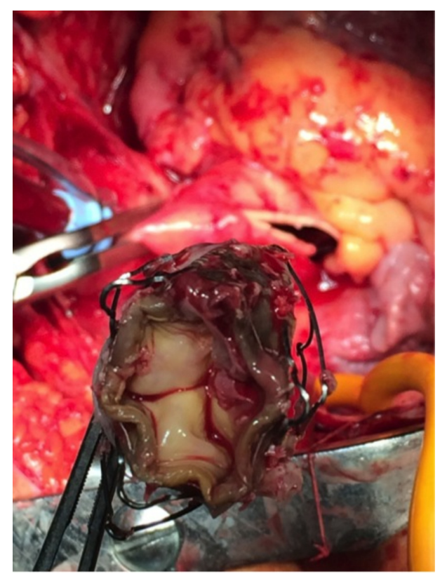
Fig. (2). TAVI explanted valve with vegetations.

Two weeks after completion of the 6-week antibiotic treatment she was readmitted with fever, a new aortic diastolic murmur and signs of peripheral embolism (Fig. 1). The patient was treated empirically with vancomycin and cefepime. A new TEE showed a periannular abscess (Movie (Supportive/Supplementary Material). P. aeruginosa with the same antibiotic resistance phenotype of previous isolation grew in all of 4 blood cultures. Laboratory tests were remarkable for a white blood cells count of 9,400 per mm<sup>3</sup> (85% neutrophils), haematocrit 34%, haemoglobin 11.3 g/dL, erythrocyte sedimentation rate of 40 mm/hr and C-reactive protein of 205 mg/L. With diagnosis of early (< 60 days) PVE due to P. aeruginosa complicated with periannular abscess an open SAVR was performed despite a logistic EuroSCORE of 78.5% and STS score of 54.9% at that time (Figs. 2-4). Drainage of the abscess and closure of the fistulous tract was performed with replacement of the aortic prosthesis with a homograft. Antimicrobial treatment was switched to piperacillin-tazobactam and amikacin for 2 weeks. She was discharged on ciprofloxacin and cefepime for completing additional 4 weeks as outpatient parenteral antibiotic therapy. After one year of follow up the patient is in good clinical condition with no evidence of infection relapse.