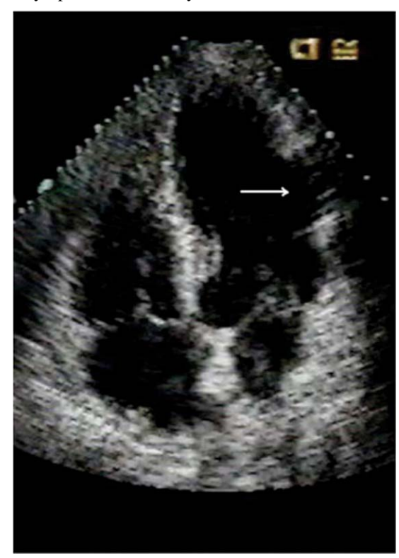
Fig. (2). Transthoracic echocardiogram done 10 years after patch repair of the subacute ventricular rupture (arrow).

trates that myocardial rupture after acute MI, although most often rapidly fatal, can occasionally be diagnosed in time for a surgical repair to be performed. In this case, the patient has survived and has been well for ten years, despite the additional co-morbidity of recurrent ventricular tachycardia requiring an implantable defibrillator. We believe that the long term favorable course in our case is attributable to preserved ventricular function. As in the case of infarction complicated by ventricular septal or papillary muscle rupture, survival after repair of the mechanical complication depends on adequate ventricular function. In our patient, with a current ejection fraction of 50 %, he has not only survived for ten years-but is asymptomatic and fully active.