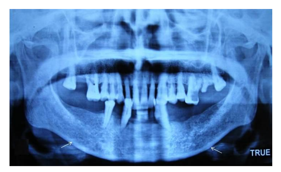
Fig. (2). Panoramic radiograph revealing mild to moderately eroded cortex.

b. Mildly to moderately eroded cortex: The endosteal margin shows semilunar defects (lacunar resorption) or appears to form endosteal cortical residues (Grade I) (Fig. 2).