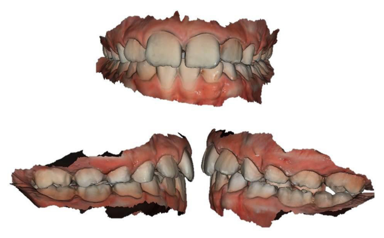
Fig. (2). Frontal, right and left view of the dental arches of a young orthodontic patient with a mixed dentition.