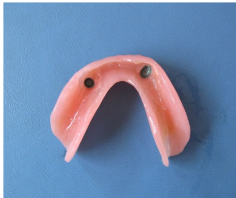
Fig. (2). Outer telescopic crowns attached into denture base.