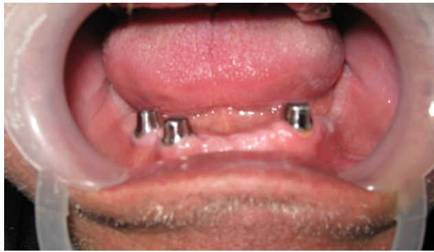
Fig. (1). Inner telescopic crowns.