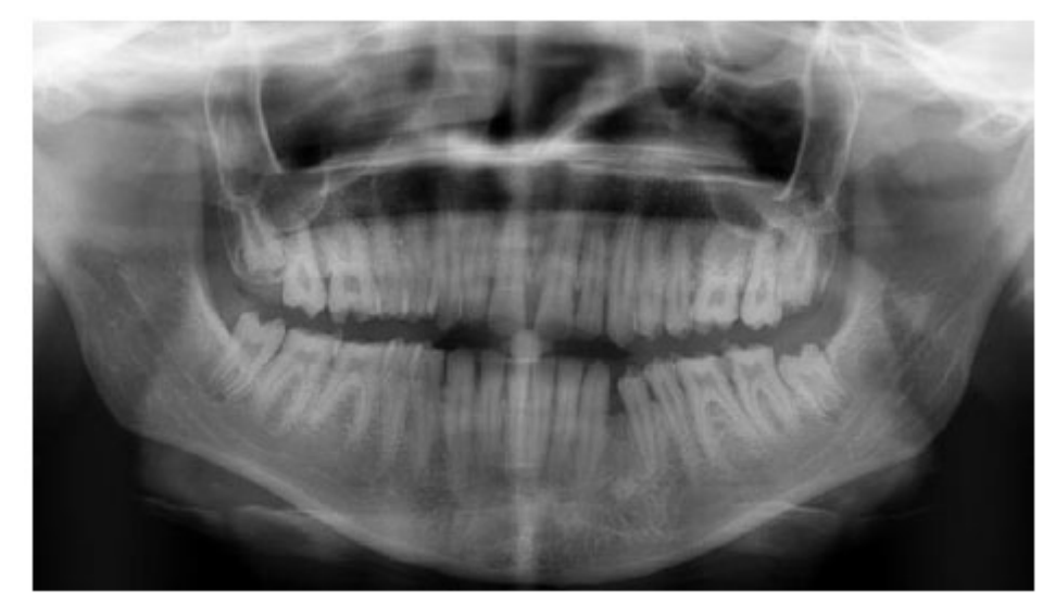
Fig. (4). Panoramic radiograph before treatment reveals regular size of pulp chambers, normal length and forms of roots and very thin enamel layer.

The maxillary and mandibular left third molar teeth were extracted to perform SEM and histologic analyzes. These teeth were totally covered by mucosa (Fig. 4). Therefore, they were selected for SEM and histologic analyzes by the purpose of examining the tooth structure of the patient which had not been exposed to the oral environment. SEM and histologic analyzes were performed on the extracted mandibular and maxillary third molar teeth (Figs. 5 and 6). One of the third molar teeth was fixed in 4% glutaraldehyde. The tooth was then cut longitudinally, and the sections were coated with gold (Sputter Coater SC7620, Polaron, VG Microtech, England). The analysis was done via SEM (JEOL, JSM-6060LV, Tokyo, Japan). SEM analysis showed that there was an insufficient enamel layer (Fig. 3). Additionally, the other third molar tooth was demineralized with 10% formaldehyde for 3 weeks. The tooth was then cut longitudinally, and it was stained with hematoxylin-eosin stain. Histological findings revealed that dentin structure was intact and there was no irregularity in tubular structure. These findings confirmed that there was no defect related to dentin (Fig. 4).