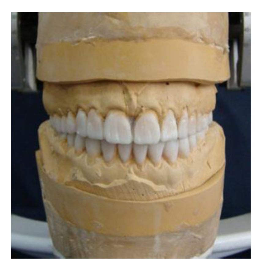
Fig. (7). Full mouth diagnostic wax-up of articulated diagnostic models at increased OVD.

opened 5 mm in the anterior region. Furthermore, to predict the last appearance of the restoration, diagnostic wax-up was prepared at the determined vertical dimension (Fig. 7), and expected treatment outcome was performed with the digital smile design software (Romexis 4.5, Planmeca USA, Inc).