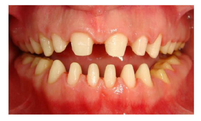
Fig. (8). Frontal view of intraoral preparation with chamfer cervical finish line.