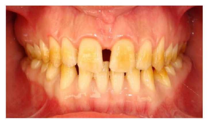
Fig. (1). Intraoral frontal view before treatment shows discolored teeth and diastema.

A 20 years old woman was referred to Gazi University Department of Prosthodontics with a chief complaint of tooth discoloration, diastema, unsatisfactory esthetics and slight tooth sensitivity. The medical and dental history revealed that the patient's family was not affected by AI. A renal ultrasound scan was normal, and it showed no evidence of nephrocalcinosis. Laboratory findings, including serum electrolytes, calcium, phosphate, urea, creatinine, alkaline phosphatase and parathormone levels were all normal. Clinical examination of the patient showed the insufficient enamel thickness, and the patient's anterior and posterior teeth were discolored (Fig. 1). The panoramic radiography also showed that the thin enamel layer could not be distinguished from the underlying dentin (Fig. 2). There were no anterior open bite and missing teeth. However, short crowns, multiple diastema, occlusal wear with exposed dentin in the posterior areas, poor contact points and dental caries are the additional clinical findings (Figs. 2 and 3). The roots showed normal length and form. The pulp chambers were regular in size. Her oral hygiene was acceptable with no signs of gingivitis (Fig. 1).