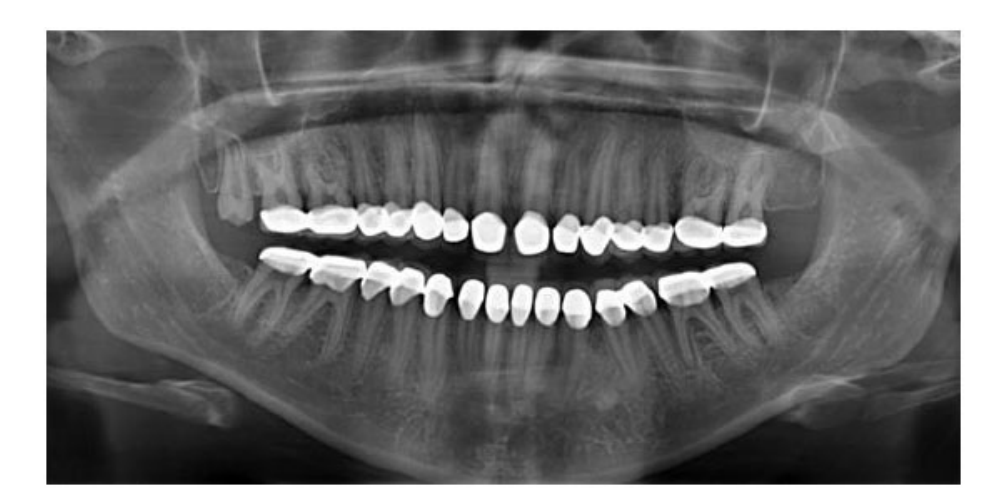
Fig. (12). Postoperative panoramic radiograph, zirconia based ceramic crowns in anterior region and metal-ceramic restorations in posterior region.

After full mouth prosthetic rehabilitation, mastication capacity and facial appearance were improved, and there was no tooth sensitivity or complication related to temporomandibular joint. Radiographical and clinical examinations revealed no evidence of disorders associated with the restored teeth or periodontal structures (Figs. 12 and 13 ). The regular clinical and radiographic follow up have been carried out at 3<sup>rd</sup>, 6<sup>st</sup>, 12<sup>nd</sup>, 24<sup>th</sup> months and 3<sup>rd</sup> year postoperatively with visual and radiographic examinations. A 3-years follow-up revealed that the patient was still pleased with function, dental esthetics and facial harmony.