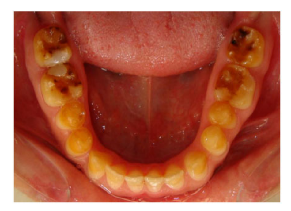
Fig. (3). Intraoral occlusal view of lower jaw.

The maxillary and mandibular left third molar teeth were extracted to perform SEM and histologic analyzes. These teeth were totally covered by mucosa (Fig. 4). Therefore, they were selected for SEM and histologic analyzes by the purpose of examining the tooth structure of the patient which had not been exposed to the oral environment. SEM and histologic analyzes were performed on the extracted mandibular and maxillary third molar teeth (Figs. 5 and 6). One of the third molar teeth was fixed in 4% glutaraldehyde. The tooth was then cut longitudinally, and the sections were coated with gold (Sputter Coater SC7620, Polaron, VG Microtech, England). The analysis was done via SEM (JEOL, JSM-6060LV, Tokyo, Japan). SEM analysis showed that there was an insufficient enamel layer (Fig. 3). Additionally, the other third molar tooth was demineralized with 10% formaldehyde for 3 weeks. The tooth was then cut longitudinally, and it was stained with hematoxylin-eosin stain. Histological findings revealed that dentin structure was intact and there was no irregularity in tubular structure. These findings confirmed that there was no defect related to dentin (Fig. 4).