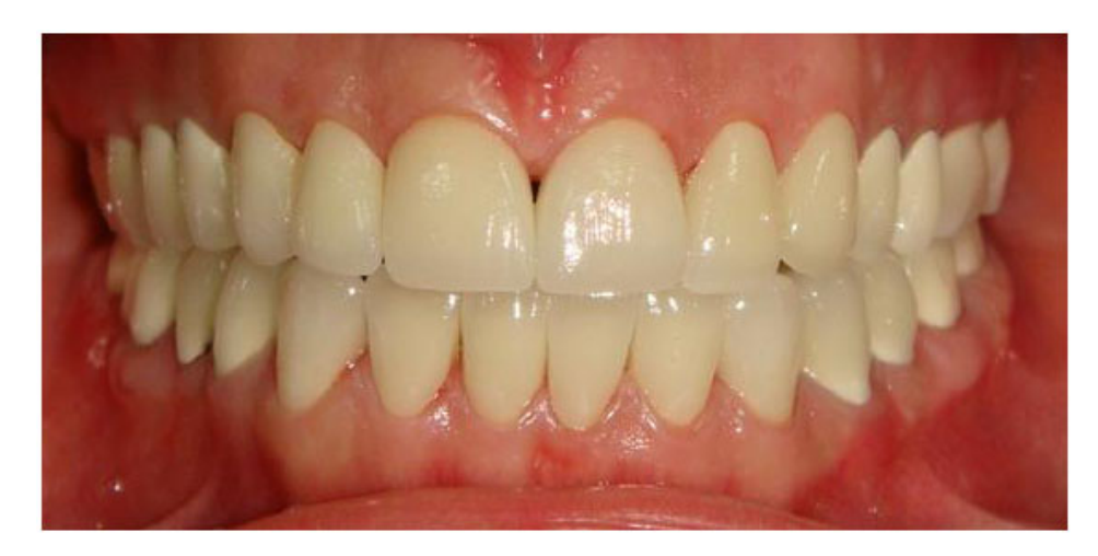
Fig. (11). Intraoral view of the patient at the end of the prosthodontic treatment at increased OVD.

The patient was rehabilitated with metal alloy (Microlit Isi, Schütz Dental Group) - ceramic (Cerabien ZR Noritake) fixed partial dentures in the posterior regions. In order to achieve better esthetic appearance and to camouflage the AI affected tooth color, zirconia ceramic (Katana, Kuraray Noritake Dental Inc) based crowns were used in the anterior regions of low and upper jaws (Fig. 11). With this prosthodontic rehabilitation, maximum interdigitation and a canine guidance could be achieved. Metal-ceramic fixed partial dentures were cemented with zinc polycarboxylate cement (Adhesor® Carbofine; Kerr) and zirconia ceramic crowns cemented with self-etch dual cured resin cement (Maxcem Elite, MXE; Kerr). Following cementation, a maxillary protective occlusal splint was manufactured to protect the restorations from chipping or fracture due to the bruxism. The patient was instructed about oral hygiene maintenance.