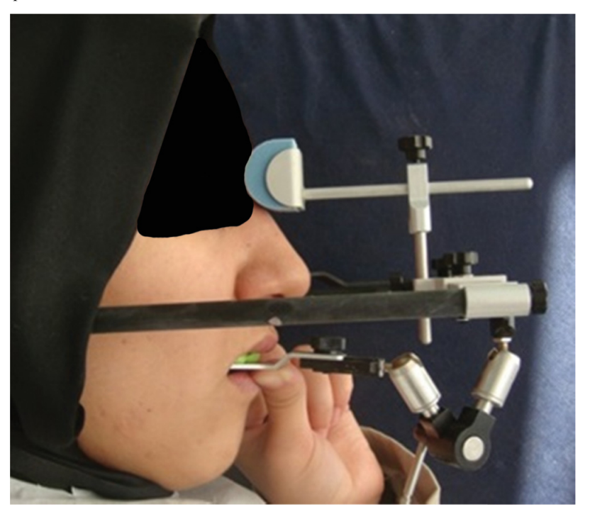
Fig. (10). Extraoral view of face bow transfer.