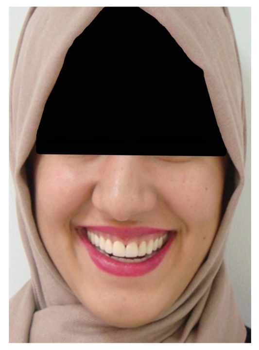
Fig. (13). Final facial photograph taken after treatment. The patient was very satisfied with the results in terms of both esthetic, function and phonation.