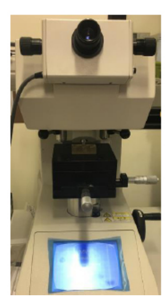
Fig. (2). The specimen was tested using a Vickers Hardness Tester (Shimadzu HMV-2, Shimadzu Corporation, Kyoto, Japan).

Fig. (1). Root section was embedded in self-curing acrylic resin, and the root canal dentin surface was facing up.