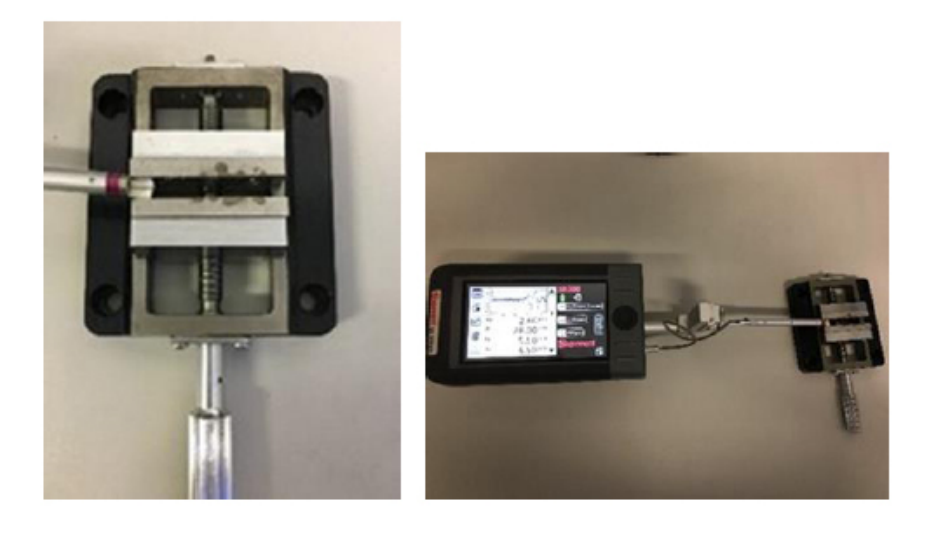
Fig. (3). The specimen was placed on the flat table surface, and a clamp was used to hold specimens stable in its position (A), the values of surface roughness were displayed digitally on the screen of the portable digital roughness (SR 300, Taylor Hobson, Leicester, England) (B).