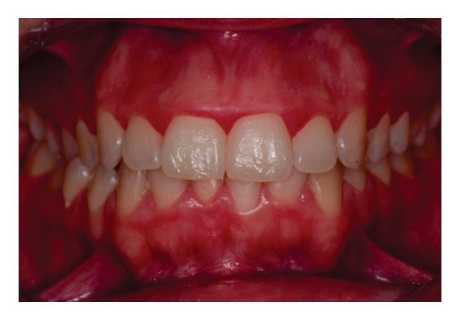
Fig. (2). Disharmony in the regular concave arch, alteration in the gingival Zenith.