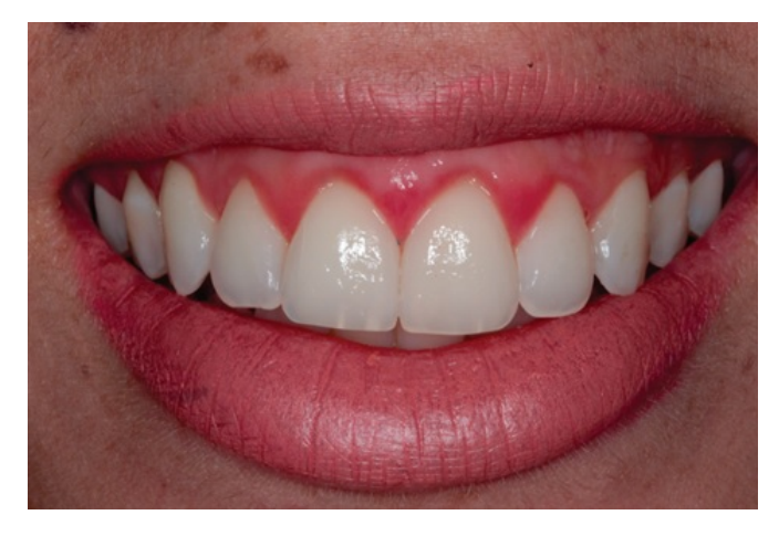
Fig. (5). After flap surgery for gingival recontouring. With a 60-day postoperative period, gingival excess is still present after A gingivectomy.