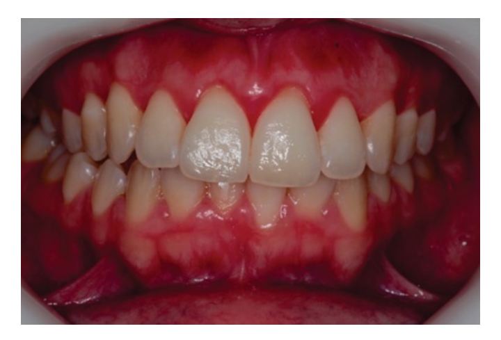
Fig. (4). Post-operative 60 days after the clinical crown increase.