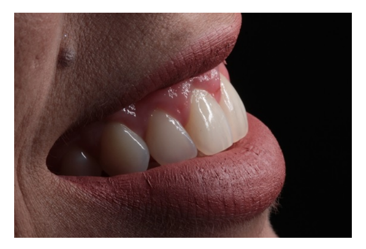
Fig. (15). Lateral view, follow-up a year and 6 months.