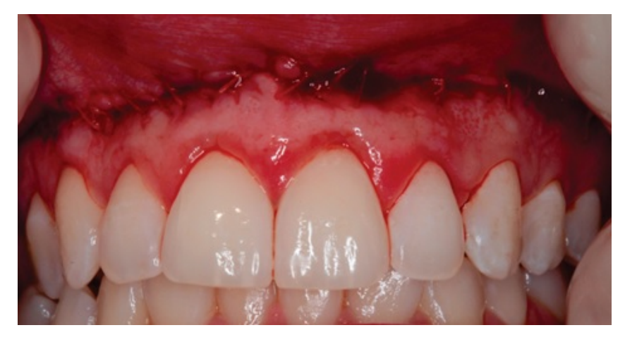
Fig. (11). Synthesis of the region after the procedure.