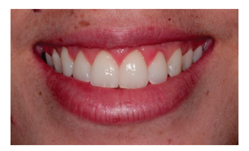
Fig. (12). Post-operative of 7 days.