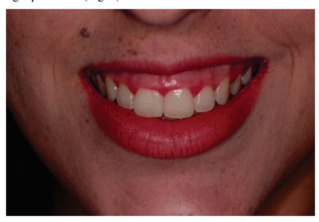
Fig. (1). Initial appearance of the smile.

A clinical examination was performed, wherein the anamnesis patient did not raise any other complaints, in addition to the one previously described, and denied the presence of underlying diseases. In the physical examination, a disharmony of the regular concave arch and absence of gingival zenith in elements 11 and 21 were observed, but the gingiva presented a healthy appearance with orange peel and light pink color (Fig. 2).