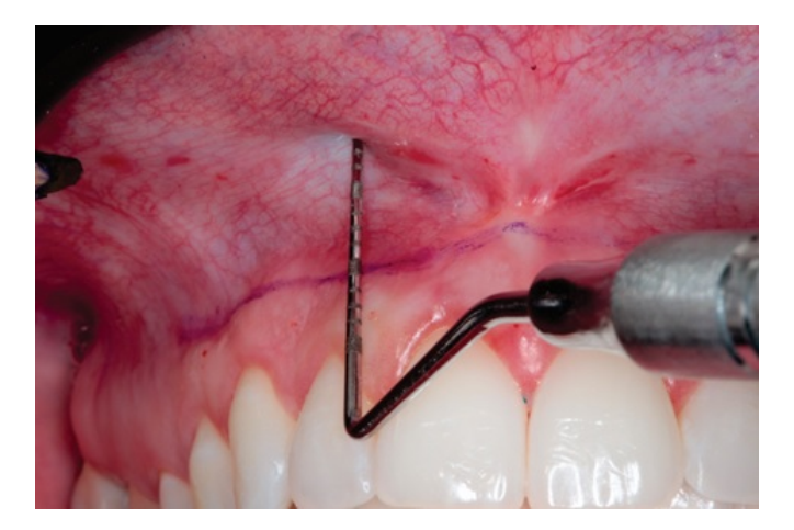
Fig. (7). Measurement for Lip Repositioning Technique, wherefrom the 5mm obtained previously, the value for demarcation of the upper limit was doubled.