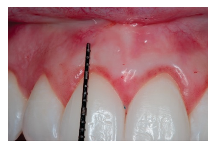
Fig. (6). Examination of the gum area exposed during the smile.