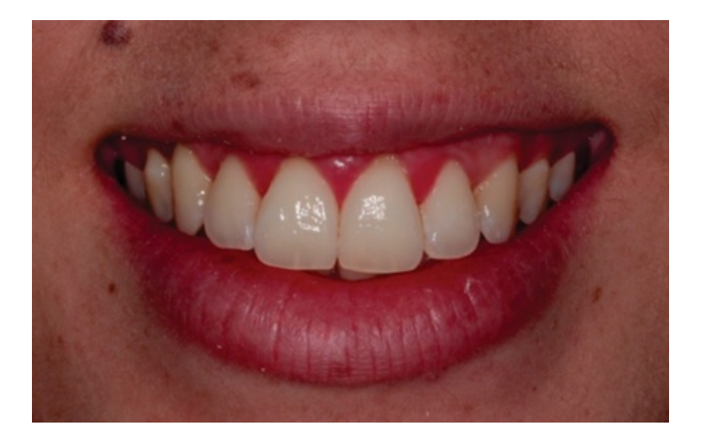
Fig. (13). Postoperative 6 months after the repositioning of the lips.