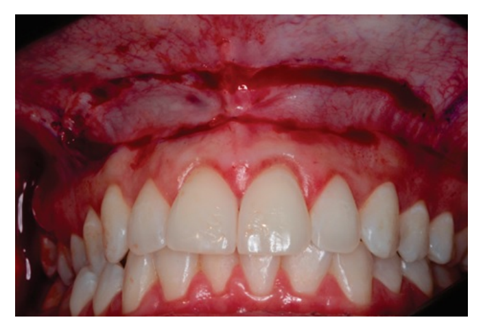
Fig. (8). Complete incision of the tissue to be removed from the demarcation lines.