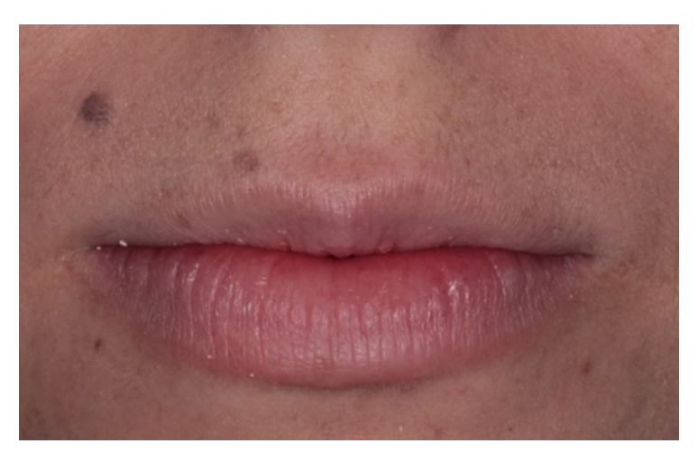
Fig. (16). Rest position photo of the patient in follow-up a year and 6 months.

The proposed treatment plan re-established the harmony of white and red esthetic showing favorable results during the follow-up of the patient, without any kind of operative complications, which indicates the viability of the association of the techniques used when correctly indicated.