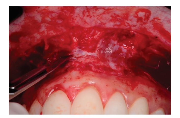
Fig. (10). Periostial incision.