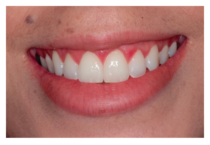
Fig. (14). Follow-up a year and 6 months.