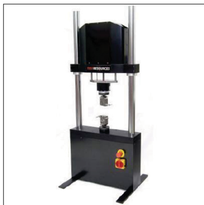
Fig. (2). Universal mechanical testing machine for measuring load on teeth assessing resistance to fracture.