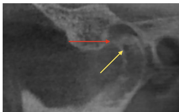
Fig. (2). Subchondral cyst (yellow arrow) and osteophyte (red arrow).

The articular space was also assessed on the sagittal reformat according to the following algorithm (Fig. 3):