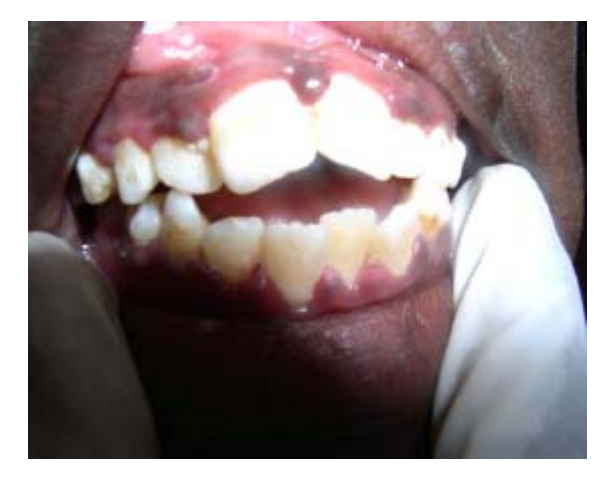
Fig. (1). Acute necrotizing ulcerative gingivitis (ANUG) showing characteristic punched-out crater-like ulcers. (see also Fig. 2 B ).

Antecedent Oral and Systemic Conditions. Poor oral hygiene is a significant risk factor and follows as a natural sequel of ignorance and poverty rife in these communities [13, 34]. Poor oral hygiene is an essential predisposing condition to necrotizing ulcerative gingivitis (NUG) [13, 37]. NUG, generally considered a key predisposing factor (and not infrequently alluded to as a precursor lesion) to noma, is a socioeconomic disease that was seen almost exclusively among children in the developing countries following the end of the Second World War [25, 37, 38]. Clinically, NUG presents as a recurring gingival infection of complex etiology, characterized by necrosis of the interdental papillae, spontaneous bleeding, and pain (Fig. 1). Like noma, the pathogenesis of NUG is poorly understood although causative association with specific microorganism such as spirochetes, Prevottela intermedia, cytomegalovirus, Epstein-Barr, herpes simplex