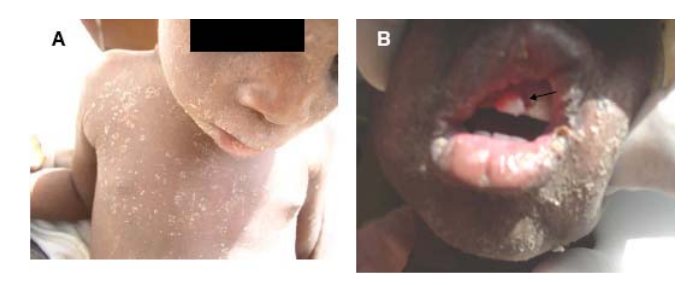
Fig. (2). Patients with measles ( A and B ). Measles ( B ; arrow) usually antedate ANUG. (B; arrow).

viruses, and the measles virus is often cited [13, 25, 39-42]. Often patients may be under stress, immunosuppressed, or have endocrine dysfunction as additional predisposing conditions [3, 38, 43, 44].