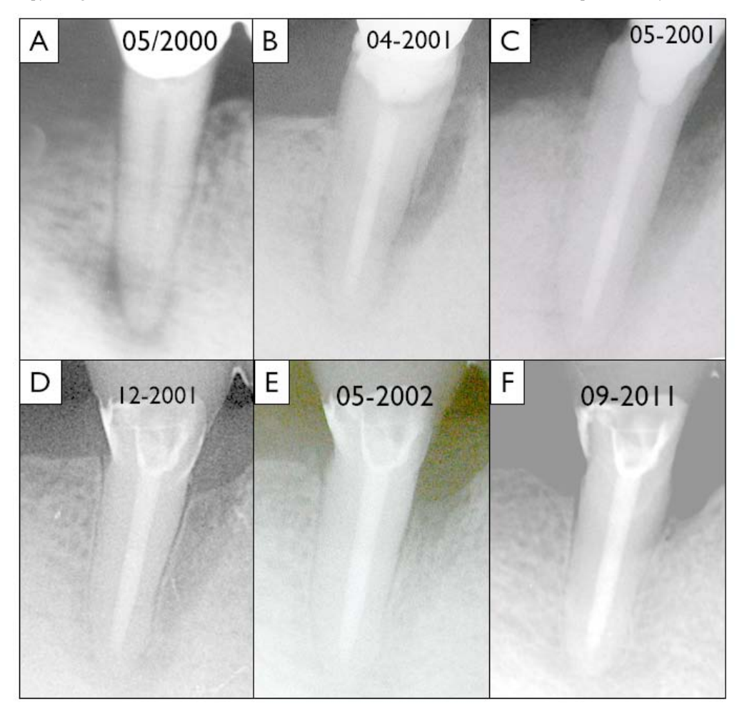
Fig. (1). Radiographic sequence of the presented case: A ) baseline image of tooth 45 showing the periapical translucency in May 2000, B ) situation after the endodontic therapy and the development of a 9 mm pocket (April 2001), C ) radiograph after periodontal surgery and ablative removal of the cemental tear (May 2001), D ) immediately after restorative treatment (December 2001), E ) situation one year after surgery and 6 month after oral rehabilitation (May 2002) and finally F ) status after more than ten years after the surgical intervention (September 2011).

to 45 without any swelling and both premolars were nonresponsive to CO_2 -snow. Crown margins around the three abutments were deficient, had extensive secondary caries and the access cavities were blocked with food debris. Maximal probing depth around 44 and 45 was 4 mm with bleeding on probing. The preoperative radiograph showed two large apical radiolucencies with diffuse margins (Fig. 1A). A diagnosis of asymptomatic apical periodontitis was made for both teeth.