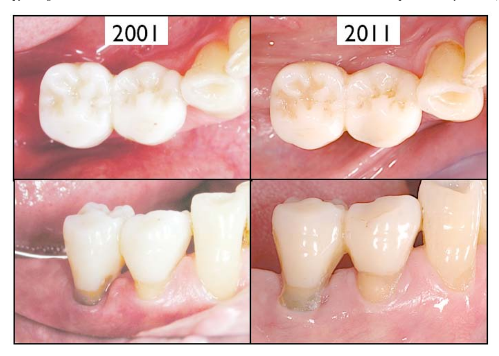
Fig. (3). Clinical situation after restoration (year 2001, left) and after 10 years (right). Some generalized recession had developed. Some plaque is visible. Otherwise the situation is stable. No probing pocket depths> 4 mm were recorded.

brushes, for the first 3 months. The patient was recalled at 3 and 6 months. At the six-month re-evaluation, no pockets \geq 3 mm and no bleeding on probing were detected. Treatment was completed with the adhesive placement of an indirect fiber-reinforced endocrown without post but a central retention cavity inside the pulp chamber (Targis-Vectris, IvoclarVivadent, Schaan, Liechtenstein). One year after surgery and 6 month after restorative treatment, there were still no clinical signs of inflammation or pocket formation. The radiograph showed evidence of good endodontic and periodontal healing with signs of the formation of a periodontal ligament (Fig. 1D , E ). The patient then left our clinic and was referred back to a private dentist. Ten years after surgery, we were able to contact the patient and re-examine the situation.