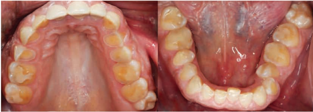
Fig. (2). Initial situation: Upper (left) and lower jaw (right) at the initial situation. Severe loss of tooth structure due to anorexia nervosa.