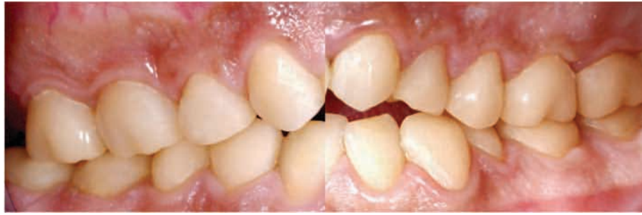
Fig. (5). Recall situation: Right and left side at the second recall after insertion.

and a circular minimum thickness of 1.5mm. In some cases composite materials can be used, but it takes a lot of valuable chair-time and porosities are likely to appear [1]. To overcome these problems, new CAD/CAM materials have been developed in the last years and there are several polymer-infiltrated-ceramic-network materials (PICN) on the market now [2]. PICN materials have mechanical properties that imitate natural teeth, which is a new approach in restorative dentistry. Young's modulus is close to dentin, Vickers hardness lies between enamel and dentin. These materials can be milled to thin layers, but are still strong enough to prevent cracks which are stopped by the interpenetrating polymer within the network. Depending on the clinical situation, minimally- up to non-invasive restorations can be milled. Therefore, PICN materials might be interesting for treating younger patients [3], patients suffering from hereditary diseases, such as Amelogenesis imperfecta [4] or patients with bruxism or dental erosions [5].