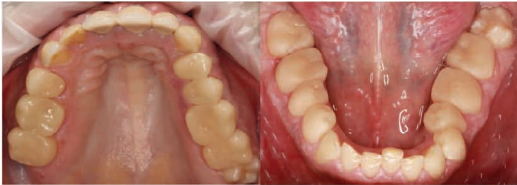
Fig. (3). Final situation: Upper (left) and lower jaw (right) at the first recall after insertion of ENAMIC crowns.