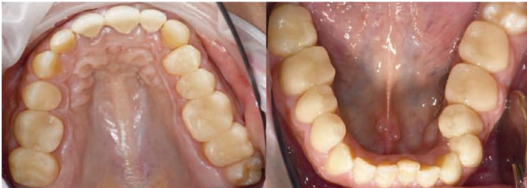
Fig. (4). Recall situation: Upper (left) and lower jaw (right) at the second recall after insertion.

phoric acid for 20 seconds. A two-component adhesive: OptiBond FL (Kerr Dental, Rastatt, Germany) was used on both tooth and restoration surfaces. Following air thinning, the adhesive on the teeth was light-cured. A thin layer of Variolink II A2 (Ivoclar Vivadent) was brushed into the crowns that were subsequently seated immediately intraorally. The restorations were light-cured for 60 s from each side. Margins were finished with a micropreparation diamond (Komet/Brasseler, Lemgo, Germany) and polishing disks. Occlusal contacts were checked carefully with occlusal adjustment foil. The crowns for the second premolar and molar were inserted similarly paying special attention to the interproximal contact points. The same procedure was repeated for the lower jaw and anterior teeth were adapted to the new situation using composite resin (Tetric Ceram A3, Ivoclar Vivadent). The patient was examined two weeks later (Fig. 3). All crowns were intact, soft tissues appeared healthy, no