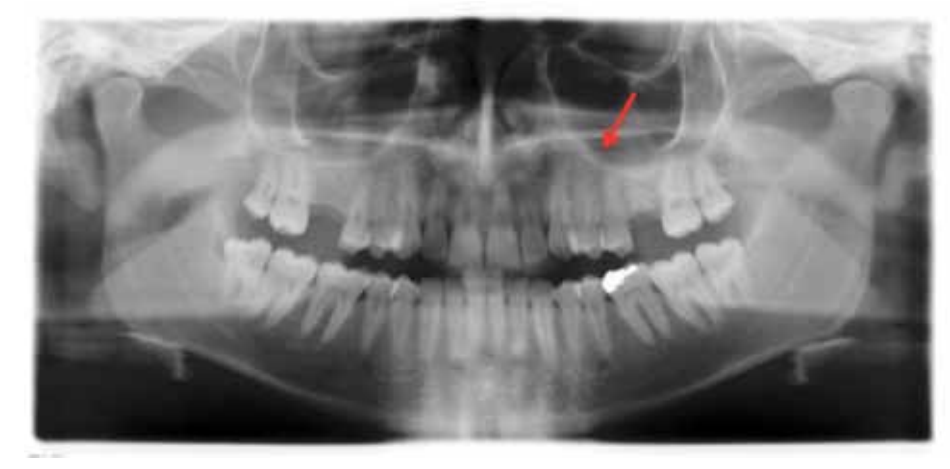
Fig. (4). Ortopantomograph, thirty months after surgery, showing the intact bone in the left premolar maxillary area.