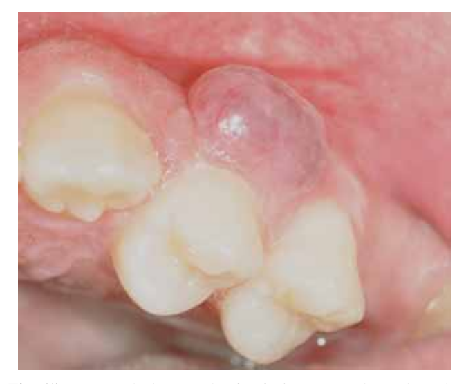
Fig. (1). Intraoral photograph of soft tissue mass located on the vestibular gingiva in the left maxillary premolars area.

while discussing its clinico-pathological and immunoistochemical features, and reviewing the literature on this topic.