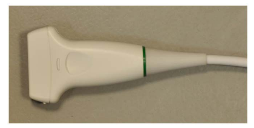
Fig. (1). A linear transducer probe with a variable frequency of 7 to 12 MHz.