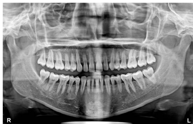
Fig. (1). OPG (Sirona Orthophos XG) reveals complete permanent dentition with no abnormality in the morphological and anatomical structures of maxilla, mandible and associated structures.