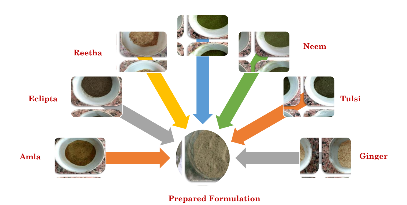
Fig. (1). Prepared Formulation.