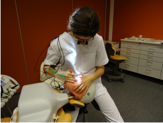
Fig. (2). The simulated work situation using plastic model teeth attached to a phantom head fixed to a dental chair.

The participants were given the freedom to choose the method with which they would complete their tasks. In the beginning of the measurements, they were allowed to adjust the chair and the dental unit according to their preferences. The adjustments were kept constant throughout the study setting.