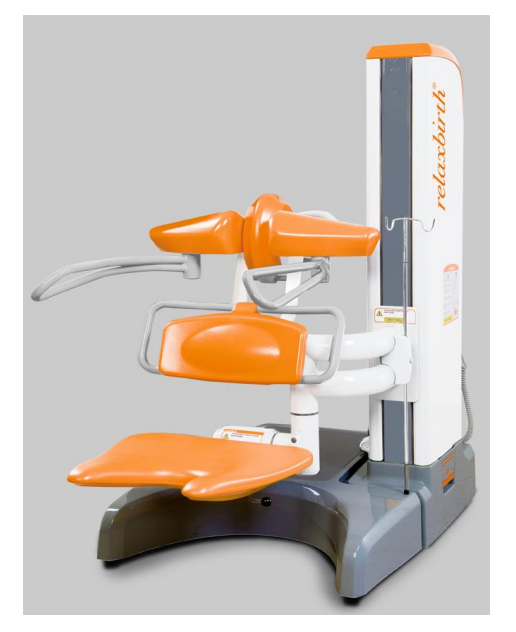
Fig. (2). Features of the tested birthing support: 1. Combined headrest, chest support and massager 2. Pushing handles, 3. Seat, 4. Arm supports, 5. Backrest 6. Backrest side handles.

The tested birthing support, called relaxbirth<sup>®</sup> (Fig. 2), can be used with the mother in several positions in the opening and pushing phase of the delivery process. The design and the adjustable opening angle of the pushing handles provide for variation in use during the pushing phase, according to the height and preferences of the mother. The arm supports offer an opportunity to relax in the opening phase of the delivery process. The seat opening offers space for the midwife or physician to assist with the childbirth. Two wheels that turn make steering the birthing support possible. The birthing support can be equipped with an adjustable infusion stand, pushing straps to enhance the leverage force of the mother and a safety harness.