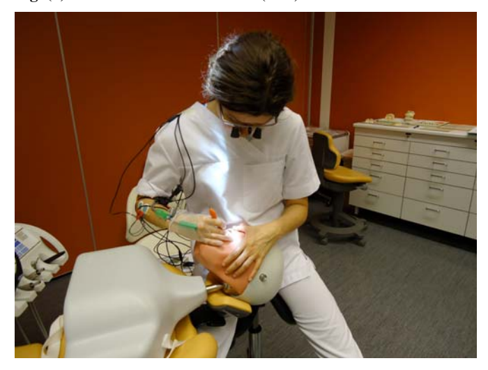
Fig. (2). The simulated work situation using plastic model teeth attached to a phantom head fixed to a dental chair.

The participants were given the freedom to choose the method with which they would complete their tasks. In the beginning of the measurements, they were allowed to adjust the chair and the dental unit according to their preferences. The adjustments were kept constant throughout the study setting.