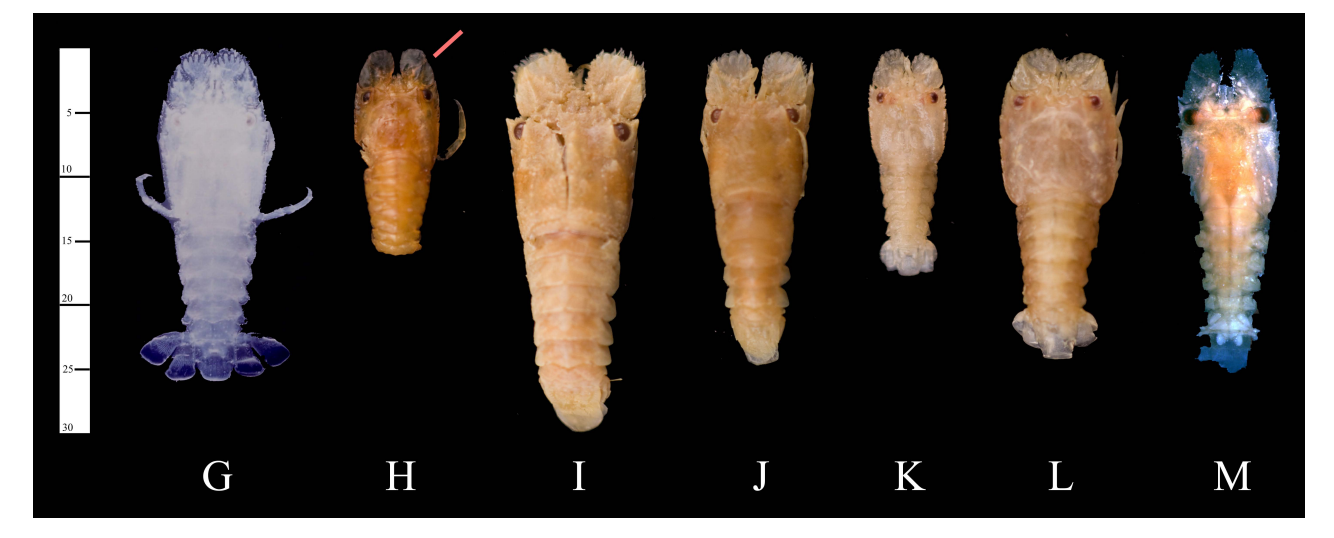
Fig. (2). The nistos/early juveniles of Scyllaridae species collected in Sicilian waters (individual letter codes as in Table 1). All could be ascribed to the genus Scyllarus , with the only possible exception of specimen H [broken tail; line pointing to the antennal margin], which might belong to the species Scyllarides latus .