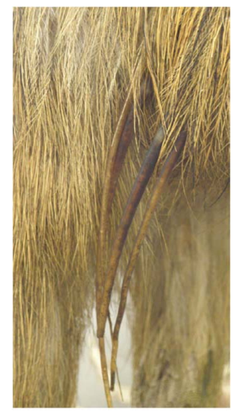
Fig. (4). Strong feathers without plume on the wing of a young cassowary in the Zoological Collection of the University of Rostock (ZSRO). Original.