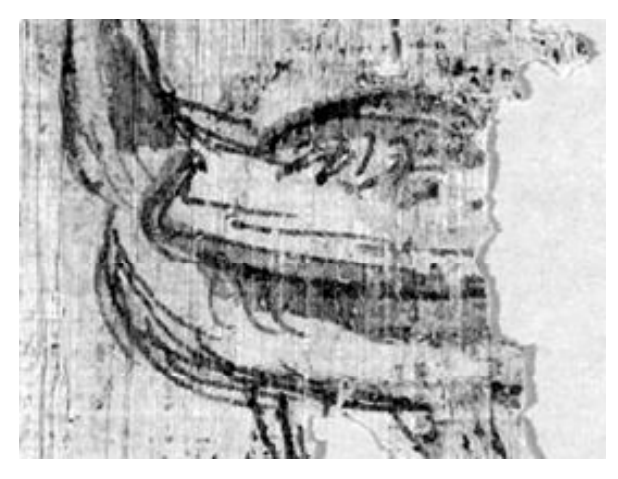
Fig. (2). Cassowary from the Artemidor Papyrus. Detail. [2].

As a result, it is suggested that the bird in question is a Cassowary, Casuarius casuarius (Linnaeus, 1758). The first argument for this comes from the drawing itself, which depicts neither the slender legs of the Black Crowned Crane, nor its curved neck, nor its almost diaphanous, bristly crest of feathers. What it shows is clearly a Cassowary, and the only thing preventing recognition of this fact is the preconception that no representative of this species would ever have made its way that far west in Antiquity. The animal's name, "stymphalis", corroborates the Cassowary theory. According to the myth discussed above, the feathers of the Stymphalian birds resemble arrows about to be launched. The Cassowary's rudimentary wings, with their almost finger-thick, unbarbed feathers (Figs. 2, 3 and 4) evoke precisely this impression. They are unmistakeably represented on the Papyrus with simple strokes applied in precisely the right position. The (captive) cassowary's inability to fly would not have been known to eye witnesses.