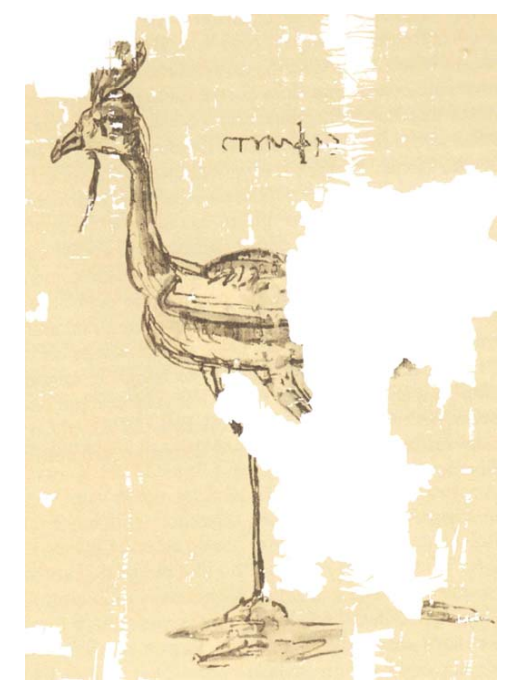
Fig. (1). Cassowary from the Artemidor Papyrus [1].

The illustration shows a stout, left-facing bird with long legs and a long, comparatively thin neck which can be ascribed to the artist's personal style (Fig. 1). There is a noticeable crest on the head, rising from behind a steep brow. The beak is short, stout and lightly curved, another mannerism of the artist [2]. An unnatural beard is found as in many drawings of the Zographos Anonymos. It resembles old Egyptian "ceremonial beards". Its meaning is still unknown. On the front edge of the wings, three clearly visible parallel strokes correspond to the thick shafts of the pinion feathers of the flightless cassowary. Below the feathered proximal shank, the left leg is missing. It is obviously shortened in comparison to the clearly visible right leg, perhaps bent or stretched out backwards, where it may have rested on a suggestion of ground. The result is a somewhat unnatural-seeming pose. The abdomen, important for diagnostic purposes, is missing. There is a dark patch so positioned that it may have been a bunch of tail or covert feathers hanging slightly downwards.