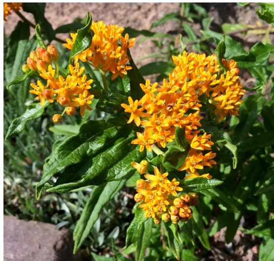
Fig. (1). Asclepias tuberosa . The stem of the plant contains milky latex with a high concentration of cardiac glycosides. The latex causes corneal oedema by a toxic reaction inhibiting the \text{Na}^+/\text{K}^+ -ATPase.