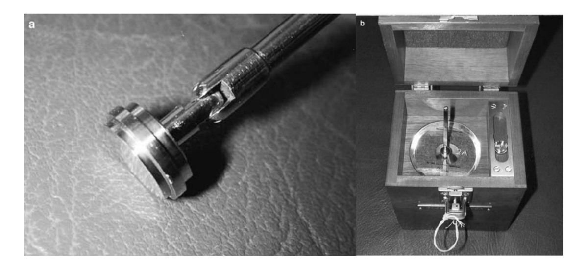
Fig. (1). (a) Tip of 90Sr emitter (Nycomed Amersham, UK). (b) The emitter in a protective case with a lid open to reveal the emitter handle and perspex shield.