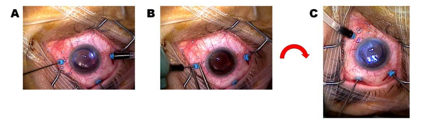
Fig. (2). The right eye of a patient undergoing 25-gauge microcannula-based transconjunctival pars plana vitrectomy (PPV). (A) The traditional approach to PPV with the infusion port placed infra-temporally and the surgeon situated superiorly operating via the two superiorly inserted microcannulas. (B) The infusion port is introduced into the supra-nasal microcannula following removal from its infra-temporal location. (C) The surgeon, the operating microscope, and the foot pedals are adjusted to a temporal orientation, and the instruments are now inserted through the temporal microcannulas for the temporal approach to PPV.

vitrectomy from the temporal side, knowing that one can easily switch to a superior approach if necessary.