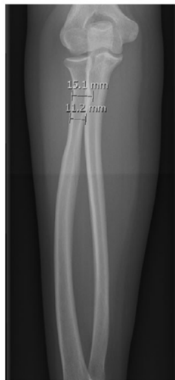
Fig. (1). Example of calculation of RBT-Diaphysis ratio.

The purpose of this matched control study was to evaluate whether the size of the RBT, measured on standard radiographs of the elbow, plays a role in the pathophysiology of distal biceps tendon ruptures. Our hypothesis was that patients with a larger RBT endure more impingement of the distal biceps tendon between ulna and RBT during pronation and are therefore more at risk for rupturing the distal biceps tendon.