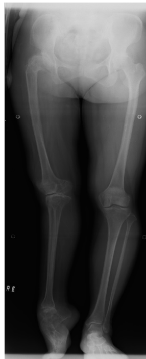
Fig. (2). A radiograph of the whole lower limbs before the operation showing severe hypoplasia in the right lower limb with an obvious equinus foot and leg length discrepancy.

The THA was planned for her symptomatic hip joints. She first underwent left THA, then underwent right THA four months later. For both THA, a posterolateral approach was used. The operations were performed using hydroxyapatite (HA)-coated cementless femoral components, HA-coated cementless acetabular shells, polyethylene liners and zirconia balls (Kyocera, Kyoto, Japan). Multihole acetabular cups were used on both sides. Five screws were used on the paralyzed right side and 2 screws were used on the non-paralyzed left side. The length of the operation time was 39 minutes for left THA and 54 minutes for right THA, and the total blood loss was 670g during left THA and 455 g during right THA. She started to move with a wheelchair two days after both operations. She had no neurological abnormalities, infections, or dislocations after THA.