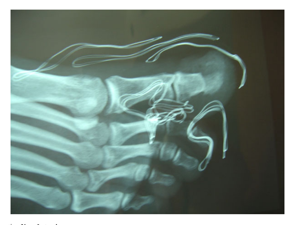
Fig. (5). Postoperative Xray Lateral.