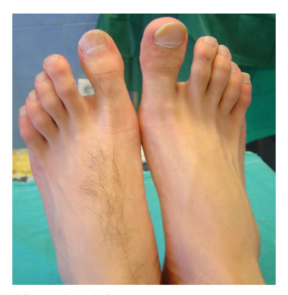
Fig. (1). Swollen Right hallux compared to normal Left.

The distal phalanx of the right hallux was swollen and tender to palpation, with no obvious erythema or increase in temperature (Fig. 1). The patient was otherwise fit and well. Blood analysis was unremarkable. Radiographic workup included plain x-rays of the foot and a CT scan and revealed a small radiolucency with cortical sclerosis and a nidus formation in the medial side of the distal phalanx of the great toe (Fig. 2).