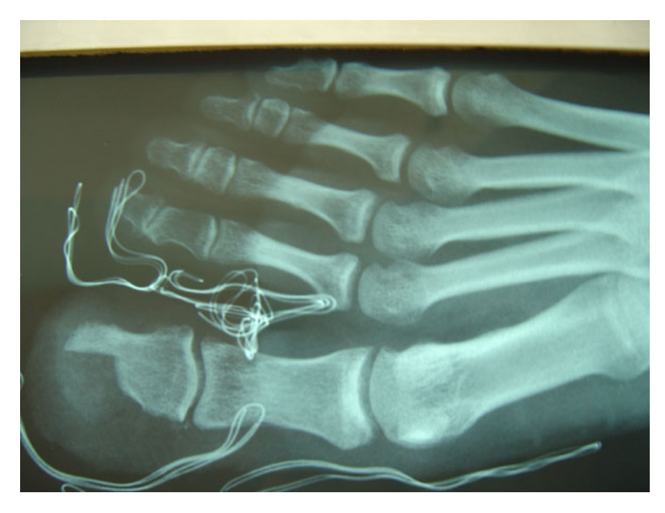
Fig. (4). Postoperative Xray AP.