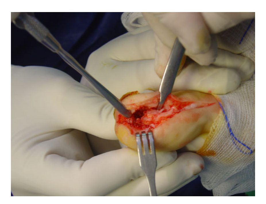
Fig. (3). Surgical approach to the tumour.

The patient underwent operative excision of the mass through an antero-medial incision with atraumatic elevation of the nail bed and nail in one layer (Fig. 3). Excision of the nidus and surrounding bone to macroscopically healthy borders was performed and histologic samples were sent for analysis (Figs. 4 and 5). The skin was closed and the nail was used as a splint to preserve the preoperative hallux shape. Pathology confirmed the diagnosis of osteoid osteoma. The patient was immediately relieved from nocturnal pains and progressively completely relieved from hallux pain. Immediately postoperatively, the patient was mobilized with a wedge shoe. At two years follow up, there were no signs of recurrence or skin and nail problems and the patient was ambulating freely.