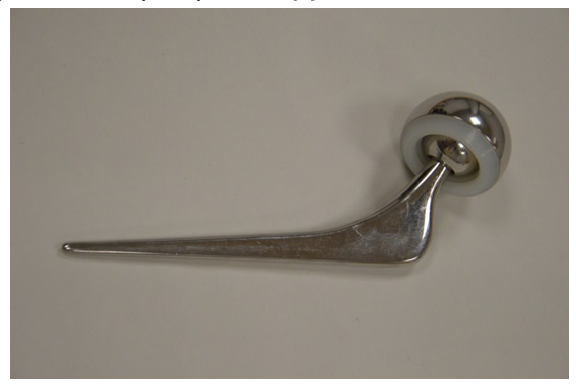
Fig. (1). Picture of a bipolar prosthetic head demonstrating the 2 separate articulations.

A bipolar prosthetic femoral head has 2 separate articulations Fig. (1). The large diameter outer head articulates with the native acetabulum. The smaller internal head sits within this and movement occurs between the two. This design was proposed to reduce acetabular wear, allow a greater range of hip movement and increase stability. Such articulations are more expensive (approximately £150 in our institution) than their unipolar counterparts [22]. They were used to try and reduce the incidence of acetabular pain requiring revision of a unipolar hemiarthroplasty to total hip replacement. Radiological evaluation of bipolar components used for neck of femur fractures has, however, revealed minimal movement between the inner and outer heads with the majority of movement being at the out shell/cartilage interface [23, 24]. Consequently, the Cochrane review from 2010 concluded that there was no evidence to support the use of the more expensive bipolar articulation [25].