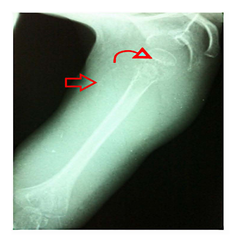
Fig. (1). Radiograph of right shoulder shows dense, linear calcification in the distal metaphysis "white line of Frankel" (curved arrow) and periosteal separation (red arrow).

One day after admission, right shoulder bruising and swelling were noticed with limited active motion's range and pain on palpation of proximal humeral metaphysis. Full passive range of motion was noted. There were no abnormal findings on the rest of the musculoskeletal examination.