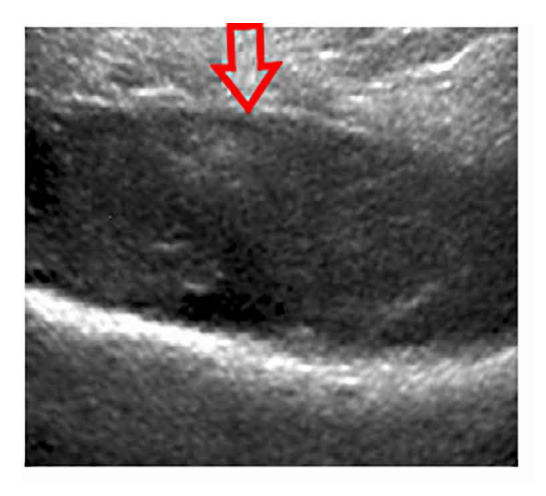
Fig. (2). The sagittal ultrasound image shows heterogeneous hypoechoic lesions compatible with subperiosteal abscess (red arrow).

Ultrasound of the right shoulder showed infiltration and denseness of the soft tissues with detachment of the periosteum in the lateral face of the Humerus (Fig. 2). Hence the diagnosis of subperiosteal abscess fistulized in soft tissues was suggested.