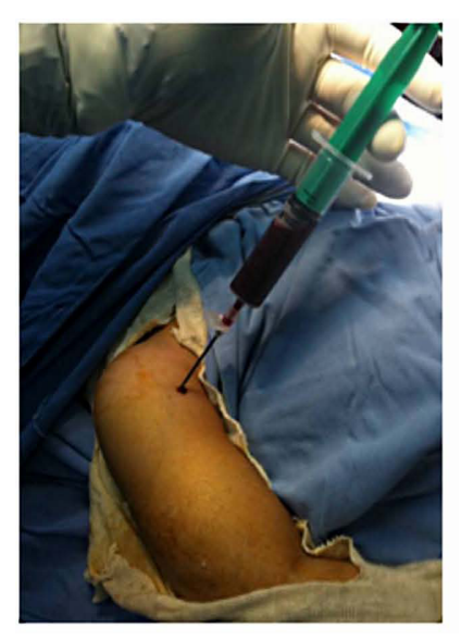
Fig. (4). Needle insertion into the fluid collection yielding a gelatinous red material in the operating room.

A surgery was quickly considered and the aspiration of the collection by a needle bringing back a gelatinous red liquid (Fig. 4). After surgical approach, it was clear that the collection interpreted as abscess was just a subperiosteal hematoma without any sign of infection (Fig. 5).