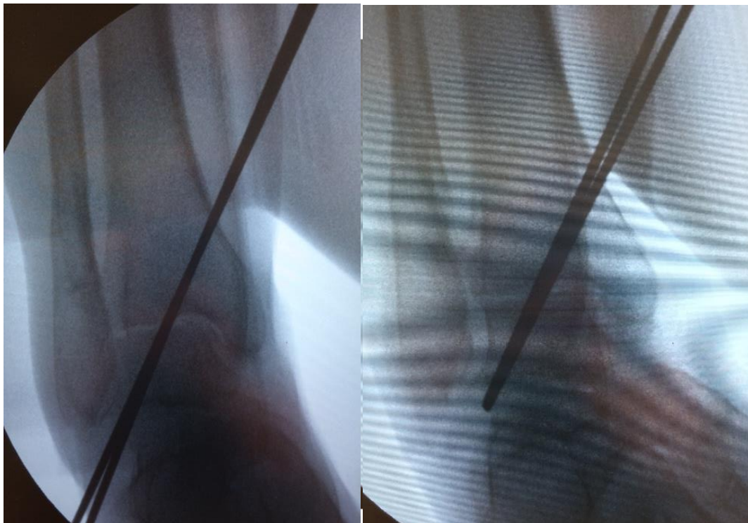
Fig. (1). C-arm view of the right ankle with two parallel K-wires introduced from lateral talar process across debrided ankle joint in Step 1 of the procedure (left). K-wires are then withdrawn with the power drill on the medial side, until they are completely flush with the lateral talar process, what can be checked by a finger palpation and/or C-arm control in Step 2 (right).

The K-wires were withdrawn with the power drill on the opposite side of the medial tibia until they were completely flush with the lateral talar process, which can be checked by finger palpation and/or C-arm control (Fig. 1). This step allows for very precise measurement of the screw length over the K-wire. After measuring the screw length over the K-wire (Fig. 2), the K-wires were pushed back with the power drill again to stick out from the talus entry points. This maneuver serves as a backup and helps remove K-wires in case they break or bend while drilling with a cannulated drill or during final screw insertion.