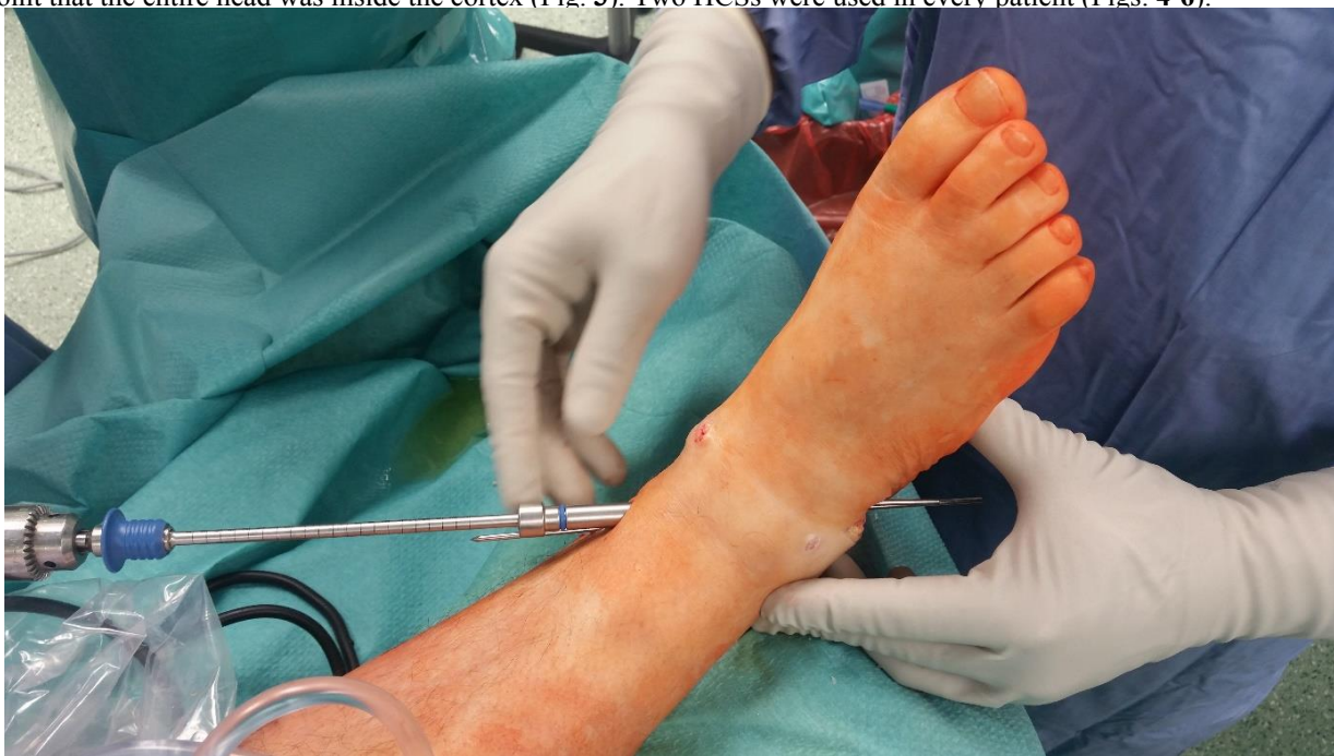
Fig. (3). Antegrade drilling with soft tissue protector inserted. Note the K-wires are pushed back down again and extend from wound on the lateral side. That manoeuvre serves as a backup and helps to remove K-wires in case they brake or bent while using cannulated drill.

A stab incision was performed around the K-wires to the medial tibia, a soft tissue protector inserted, and cannulated drill introduced from the tibial medial cortex into the talus. A 7.3-mm cannulated HCS was introduced to the point that the entire head was inside the cortex (Fig. 3). Two HCSs were used in every patient (Figs. 4-6).