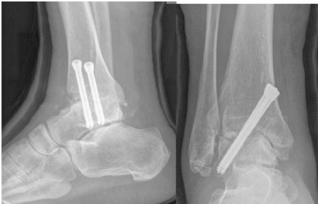
Fig. (5). Non-weight bearing AP and lateral radiographs two weeks after AAA with two parallel HCS compression. Note distal HCS threads are within lateral talar process and proximal covered in thinner medial tibial cortex causing any impingement on soft tissues.