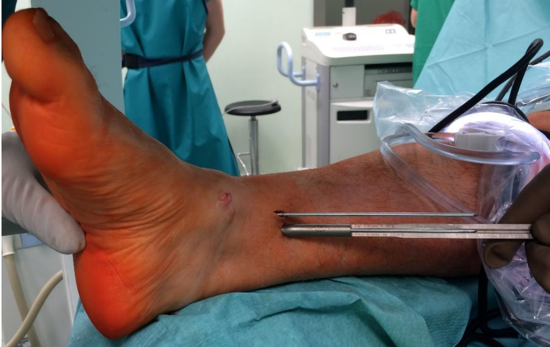
Fig. (2). Precise measurement of the screw length. The K-wires were withdrawn on the medial tibia until they were completely flush with the lateral talar process, which can be checked by finger palpation and/or C-arm control. This step allows for very precise measurement of the screw length over the K-wire.