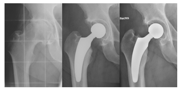
Fig. (1). Anteroposterior radiographs of a representative clinical case: 65-year-old male with primary osteoarthritis in the right hip. Left: preoperative radiograph, middle: postoperative radiograph at 6 weeks of follow-up, right: radiograph at 24 months of follow-up.