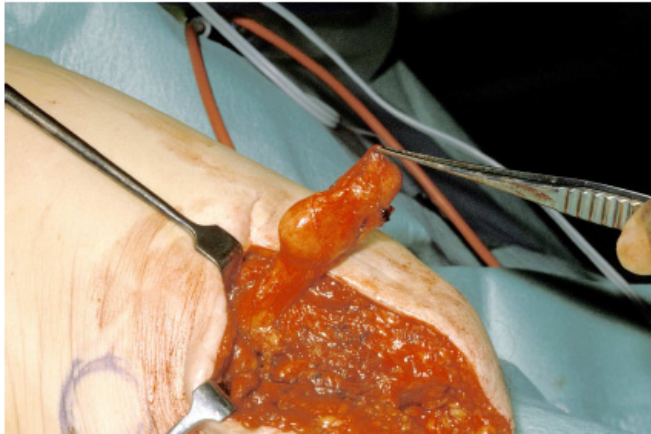
Fig. (2). Intra operative photograph of a well circumscribed mass arising from the amputated sciatic nerve.

nerve and composed of haphazardly arranged nerve tissue, consistent with traumatic neuroma (Fig. 3). He was followed up and remained symptom-free for seven years until discharged from clinic.