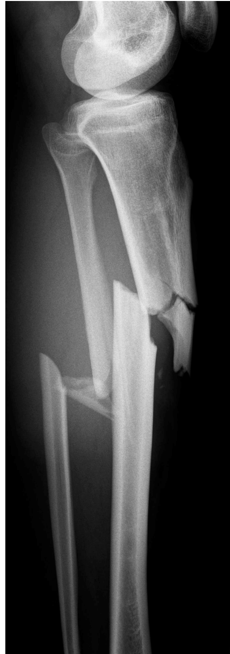
Fig. (2). Proximal right lower leg fracture of patient B.

for wound exploration under general anaesthesia in the operation room. Necrosis of the anterior, peroneal and deep flexor compartments was found. Only the superficial flexor compartment (proximal area) showed some vital muscle tissue. After consultation with the patient and his partner, it was decided to perform a transfemoral amputation. The postoperative course was marked by serious coping problems. This patient also started upon an outpatient rehabilitation course with upper leg prosthesis.