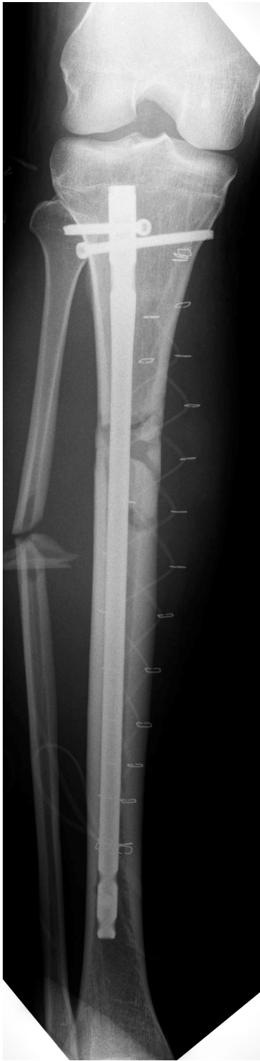
Fig. (3). Situation of patient B after intramedullary nail fixation and fasciotomy of the right lower leg.

right subcapital humeral fracture and free intra-abdominal fluid were diagnosed. Upon laparotomy, a liver rupture, which needed packing, was observed. During the same session, a head wound was treated. The right lower leg stood in an abnormal position, but the foot exhibited normal circulation. After reposition the tibial fracture was treated with an upper plaster cast. The same day, the patient was