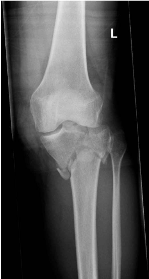
Fig. (1). Comminuted left tibial plateau fracture (Schatzker V) of patient A.

Patient B, a healthy 30-year-old man, sustained a right proximal crural fracture as a result of a direct trauma during a soccer match (Fig. 2). For this, he was admitted to a regional hospital and operated on the same day. The proximal fracture of the right lower leg was stabilised with an intramedullary nail (Fig. 3). The next day, the patient developed an ACS of the right lower leg, for which a four compartment fasciotomy was performed with a medial and lateral incision. The postoperative course was complicated by increasing pain symptoms of the right lower leg, as well as high fever. Because a wound infection was suspected, a course of intravenous antibiotics was begun. The patient was followed up with MRI-scans to rule out a deep infection or osteomyelitis. On these scans, a collection of fluid was seen; therefore, an exploration and drainage of the wound was carried out. The wound was treated with a vacuum system. Due to a lack of healing, the patient was transferred after one month to a central hospital for a second opinion. At the first outpatient visit, the patient still experienced much pain in the proximal lower leg. Sensation was almost completely absent in the foot and the lateral lower leg. No extension or flexion of the foot or toes was possible. Upon wound inspection, free exposed bone was found. Neurological examination showed complete loss of the peroneal and tibial nerves. It was decided to admit the patient