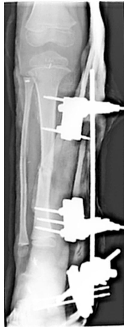
Fig. (4). Tibial fracture of patient C treated with an external fixator.

intubated and ventilated, then transferred to a central hospital for further treatment. At inspection on the second day after the trauma, diffuse oedema of the lower leg was seen. On the same day, gauze around the liver was removed at relaparotomy. On the third day, the toes of the right leg were pale and cold. After splitting the plaster, substantial capillary refill was observed. On the fourth day, the patient was extubated. Six days after trauma he complained of pain in the right leg. After removal of the plaster, extensive blistering and oedema of the lower leg with partially threatened skin was seen. The same day a four compartment fasciotomy of the right lower leg was performed. Inspection showed extensive necrosis of the four muscle compartments. After this, the patient was operated upon many times, which at last resulted in the clearance of all compartments; only the medial head of the gastrocnemius muscle remained vital. The fracture was treated with an external fixator (Fig. 4). Nearly four weeks after the accident, the considerable defect at the right lower leg was covered with a free vascularised musculus latissimus dorsi flap. An outpatient rehabilitation course followed.