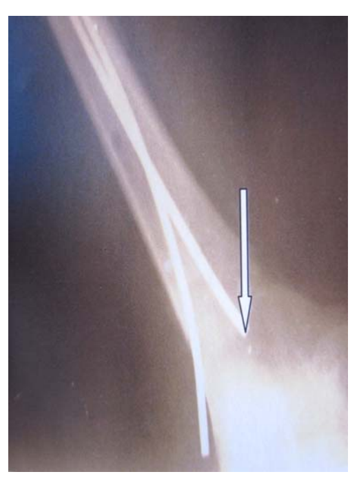
Fig. (10). post- operative radiograph showing intra- operative breakage of nail.