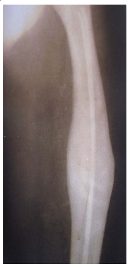
Fig. (11). post- operative radiograph at the end of 1 year showing varus angulation.