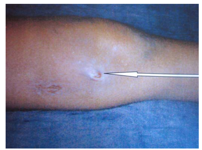
Fig. (5). bursa formation and subsequent ulceration at entry site.