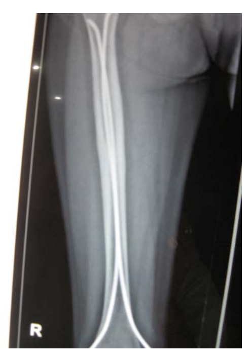
Fig. (2). immediate post- operative radiograph showing good alignment after fixation with TENS.

In our study we detected several short term complications. In our study we found the most common complication was pain at nail entry site (14 of 70, 60%) which was relieved when nail was removed. 4 cases (5.71%) had local inflammatory reaction due to nails, in the form of ulceration (Figs. 3, 4) or bursa formation (Figs. 5, 6). Superficial infection occurred in 2 cases (2.85%). At the end of 1 year, 2 cases (2.85%) of limb length discripancies in which the injured limb was about 1.5cms greater than the normal limb. Proximal migration occurred in 2 cases (2.85%). Acute reactive synovitis due to nails at 7 months post operatively occurred in 2 cases (2.85%) (Figs. 7, 8). There were 2 cases (2.85%) of knee stiffness (Fig. 9). There were also 2 cases (2.85%) of per operative breakage of nail and no part was outside the cortex (Fig. 10). Varus angulation of fracture site occurred in 4 cases (5.71%) (Fig. 11). We experienced no case of delayed or non- union or deep infection in our series (Table 1).