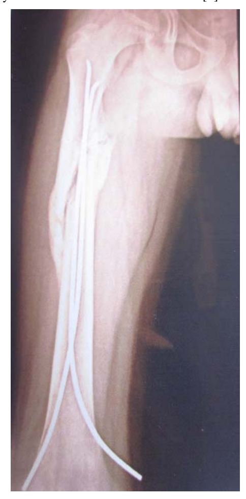
Fig. (6). post- operative radiograph of Fig. (5) showing prominent medial end.

nailing procedure, overall promising results published in different international journals and patient's demand probably has instilled confidence in our minds to begin this apparently new mode of fixation. However, starting titanium nailing in our set up was not a smooth sailing initially but we gradually did overcome the initial hindrance [8].