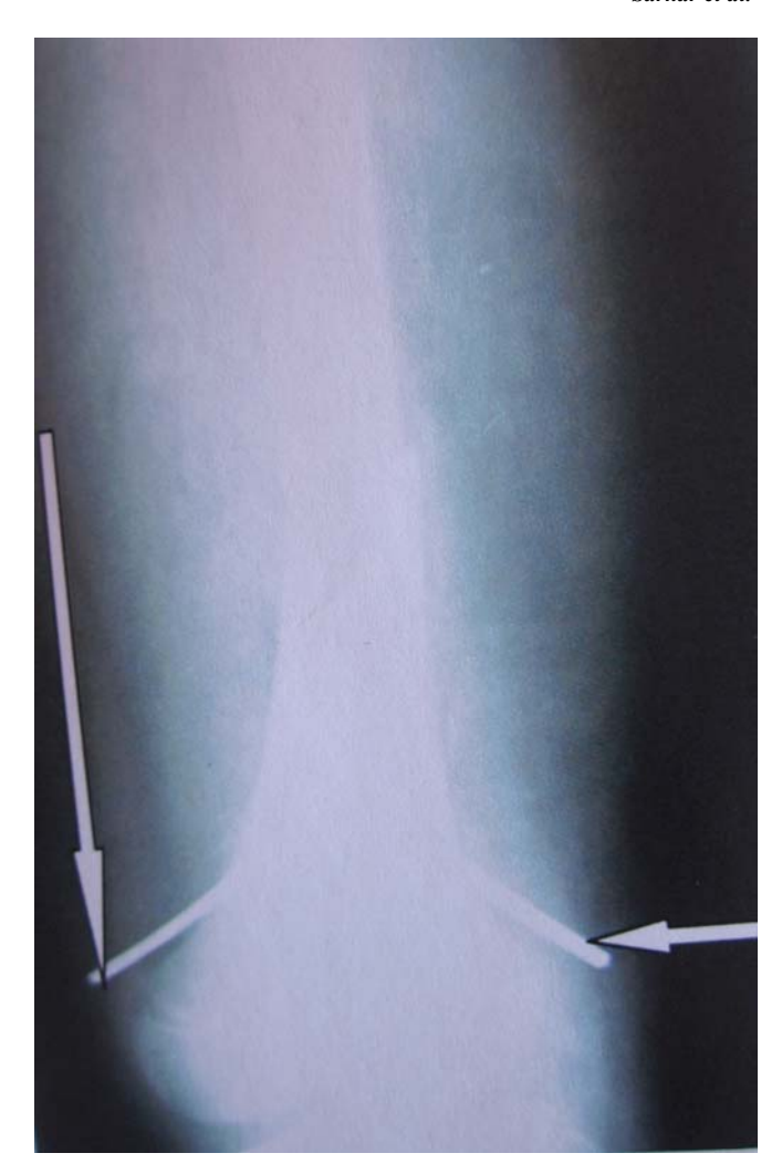
Fig. (4). post- operative radiograph of Fig. (3) showing excess nail length outside the cortices.