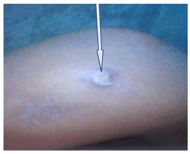
Fig. (3). inflammatory reaction due to TENS nail, medial entry.

In our study we detected several short term complications. In our study we found the most common complication was pain at nail entry site (14 of 70, 60%) which was relieved when nail was removed. 4 cases (5.71%) had local inflammatory reaction due to nails, in the form of ulceration (Figs. 3, 4) or bursa formation (Figs. 5, 6). Superficial infection occurred in 2 cases (2.85%). At the end of 1 year, 2 cases (2.85%) of limb length discripancies in which the injured limb was about 1.5cms greater than the normal limb. Proximal migration occurred in 2 cases (2.85%). Acute reactive synovitis due to nails at 7 months post operatively occurred in 2 cases (2.85%) (Figs. 7, 8). There were 2 cases (2.85%) of knee stiffness (Fig. 9). There were also 2 cases (2.85%) of per operative breakage of nail and no part was outside the cortex (Fig. 10). Varus angulation of fracture site occurred in 4 cases (5.71%) (Fig. 11). We experienced no case of delayed or non- union or deep infection in our series (Table 1).