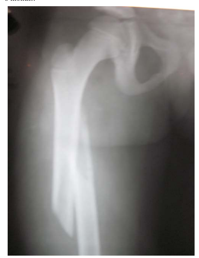
Fig. (1). Fracture mid- shaft right femur.

44 (62.86%) children had fracture in the mid-shaft (Fig. 1), 15 (21.42%) in the upper third while 11 (15.72%) in the lower third. 42 (60%) were transverse, 16 (22.8%) oblique, 7 (10%) spiral and 5 (7.2%) were comminuted fractures. 45 (64.28%) children had weight between 20kgs- 29kgs, 15 (21.42%) between 15kgs- 19kgs, 7 (10%) between 40- 49kgs while only 3 (4.3%) were between 30-39kgs. Mean interval between injury and TENS nail fixation was 4 days (2 days to 6 days). Mean post- operative hospital stay was 4.13 days (min: 2 days to max: 11 days). Minimum nail size used was 2.5mm while maximum nail size used was 4mm. All the 70 cases were managed by closed reduction (Fig. 2). Callus appeared within 3weeks, circumferential callus was seen within 5-6 weeks and full radiological union was achieved by 8 weeks to 10 weeks (mean 8.3 weeks). Time of nail removal varied from 6 months to 14 months with a mean of 8 months.