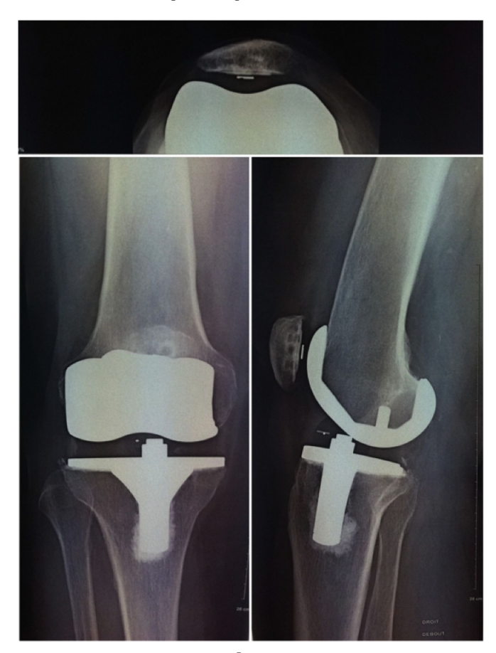
Fig. (4). X-rays of the e.motion<sup>®</sup> UC knee prosthesis 5.6 years after surgery in a 70-year-old man. Top: skyline view (knee angle 90 degrees); left: antero-posterior view (standing); right: lateral view (standing).

No adverse events were reported during the surgery. Four patients (14%) reported persistent knee pain at the 5-year visit. One of these 4 patients also showed a lack of mobility in the operated knee. Another patient showed early signs of ipsilateral coxarthrosis approximately 6 years after surgery (operated left). There were two serious adverse events, which were not considered related to the surgery procedure or the prosthesis. One patient fell and sustained a fracture of the left femur (1/3 distal) and right tibia/fibula 21 months after surgery. This patient had had a long-term deficit in his foot flexors that had not been investigated and at the 1-year visit, he reported pain in the right external popliteal sciatic nerve, localized near the fibular neck. Another patient sustained a fracture of the left femoral neck approximately 5.7 years after surgery, due to osteoporosis.