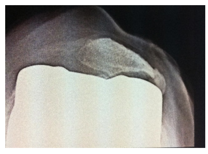
Fig. (3). At 5.6 years, 1 patient's patella was misaligned (off by 3 to 12 mm at 90^{\circ} ).