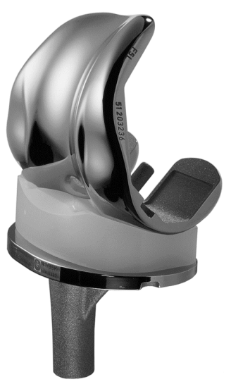
Fig. (1). Photograph of the e.motion<sup>®</sup> UC knee prosthesis (Aesculap, Tuttlingen, Germany) featuring a mobile-bearing ultracongruent rotating platform design.

The e.motion<sup>®</sup> UC prosthesis is CE-marked, classified as a Product class III and licensed for medical application to patients (Fig. 1).