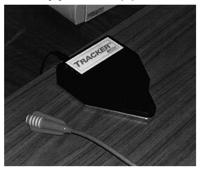
Fig. (1). Vibrometer apparatus with trigger.

The Vibrometer is a sensory modality which measures vibration perception threshold [35]. The Vibrometer used in this study is a 50 Hz computer-controlled ramped protocol where the vibration stimuli are applied through a 2 mm diameter aperture with a 1 mm diameter vibrating post (Fig. 1). Subjects were required to identify when they felt a stimulus by squeezing a handheld trigger with their eyes closed. The minimum score is 1 um and the maximum score is 180 um. A ramped protocol is regulated by the device supplying sufficient repetitions of test stimuli; to achieve a stable estimate of vibration threshold. The Vibrometer has shown excellent test retest reliability in patients with CTS with ICCs ranging from 0.86 to 0.89 [31].