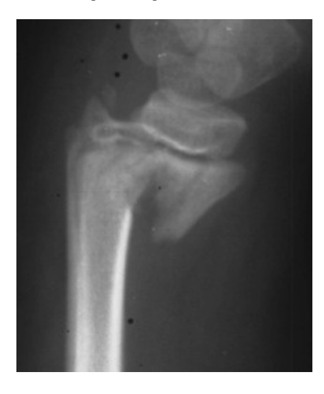
Fig. (3). Lateral radiograph of a 9-year-old girl indicated a displaced comminuted type 2 fracture.