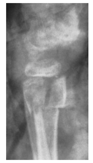
Fig. (4). Anteroposterior (a) and lateral (b) radiographs of an 11-year-old boy indicated a displaced type 3 fracture.