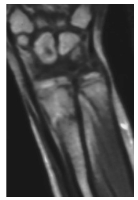
Fig. (5). Anteroposterior ( a ) radiograph of an 8-year-old girl indicated a transverse metaphyseal fracture with a longitudinal extension that crossed the physeal plate. Intraepiphyseal extension of the fracture line that was shown on T1 with contrast imaging ( b ) secured the diagnosis of an undisplaced type 4 lesion.

Both undisplaced and displaced fractures showed a degree of comminution. A type 1 or 2 lesion was considered to be comminuted, when there were two or more fracture lines within the distal fragment extending to the physis (Fig. 3). All type 3 lesions were considered to be a comminuted injury.