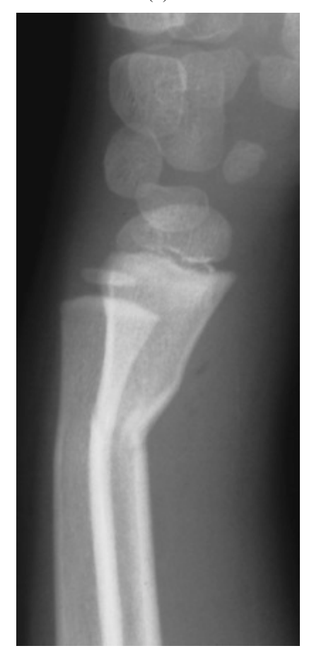
Fig. (2). Anteroposterior (a) and lateral (b) radiographs of a 10-year-old boy indicated an angulated type 1 fracture.