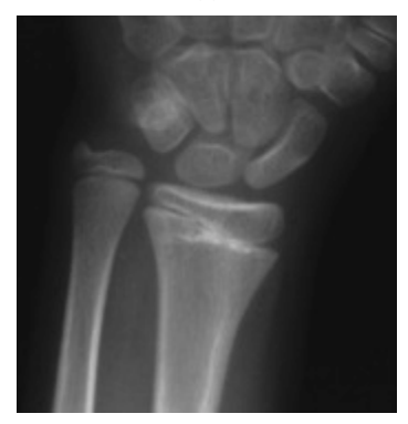
Fig. (6). Anteroposterior ( a ) and lateral ( b ) radiographs of a 9-yearold boy 5 weeks post-injury indicated a type 1 fracture with signs of periosteal healing. Diagnosis was changed to a type 5 lesion after the radiographic appearance of a bone bridge one year later ( c ).

inclusion criteria are according to Peterson [7], meaning that the fracture involves all cortical surfaces of the diaphysis or metaphysis and extends to the physis, but there is no fracture along the physeal plate, so attachment of the epiphysis with the metaphysis is not disrupted. The transverse diaphyseal or metaphyseal fracture may be angulated or displaced.