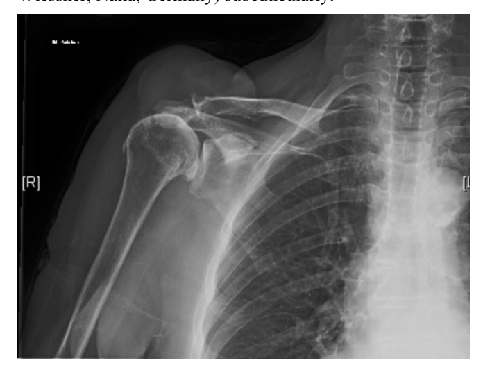
Fig. (1). There are severe degenerative changes involving the glenohumeral joint with direct bone on bone articulation between the humeral head and the undersurface of the acromion consistent with a chronic complete rotator cuff tear. There is a lobulated soft tissue mass projected superior to the acromioclavicular joint.