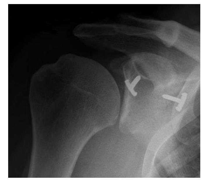
Fig. (3). AP X-rays of the right shoulder of patient 1 taken in the emergency room after reduction of the dislocation, showing mobilization of one of the two staples used 15 years earlier.

(range 24-54) months. Clinical evaluation consisted of reporting on working and sports activities, number of subsequent dislocation (if any), complete physical examination, VAS for pain [12] and well validated shoulder rating scales: Constant-Murley score [13], Simple Shoulder Test [14], ASES shoulder score [15], UCLA shoulder rating scale [16], Quick DASH [17], Rowe score [18], and Walch-Duplay score [19]. Radiological evaluation included true AP and axial views of the affected shoulder.