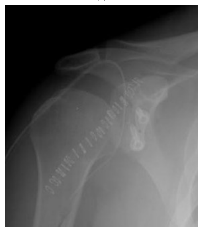
Fig. (2). The anterior capsule was tensioned and fixed to the glenoid neck with an "8 plate", to close Bankart lesion (A). Immediate post-operative X-rays showing good position of the plate on the antero-inferior scapular neck (B).

(range 24-54) months. Clinical evaluation consisted of reporting on working and sports activities, number of subsequent dislocation (if any), complete physical examination, VAS for pain [12] and well validated shoulder rating scales: Constant-Murley score [13], Simple Shoulder Test [14], ASES shoulder score [15], UCLA shoulder rating scale [16], Quick DASH [17], Rowe score [18], and Walch-Duplay score [19]. Radiological evaluation included true AP and axial views of the affected shoulder.