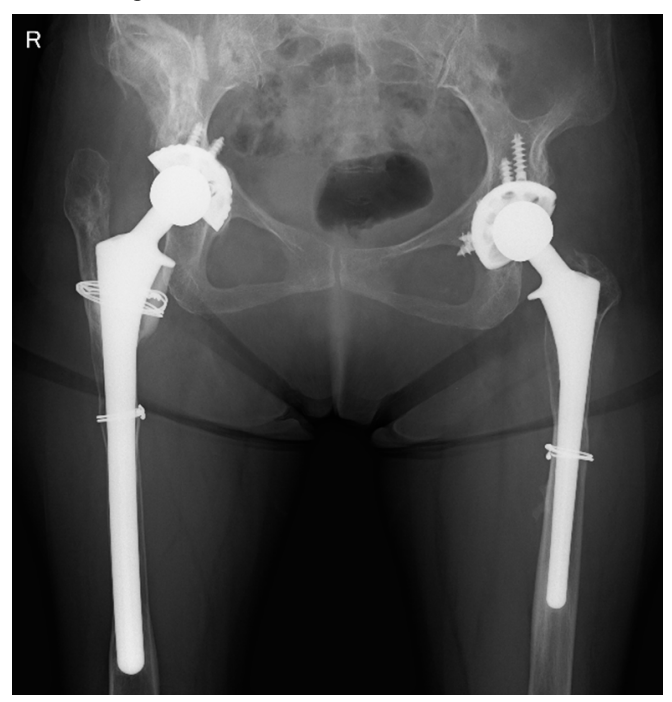
Fig. (4). An anteroposterior radiograph taken at the final follow-up examinations.

subtrochanteric femoral osteotomies [9-13]. In these reports, these osteotomies were performed to correct deformed femurs, not for shortening osteotomy, during revision THA. The Vshaped subtrochanteric osteotomy was not indicated for revision THA in the past.