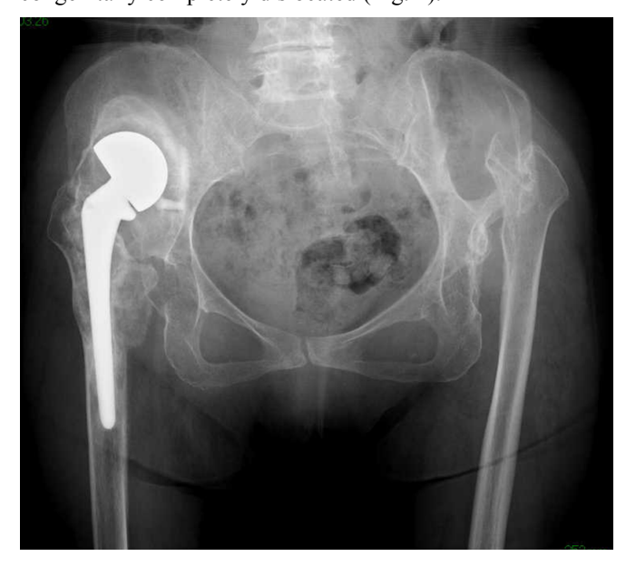
Fig. (1). An anteroposterior radiograph obtained before the revision surgery.

Roentgenograms showed that the implant of her right BHA had migrated proximally, and sapphire pins were placed at the new acetabulum. We concluded that she underwent BHA with a bone graft to create a new acetabulum in the high hip center, because her right true acetabulum was intact in spite of the hypoplasia. In addition to the right implant migration, her left hip joint was congenitally completely dislocated (Fig. 1).