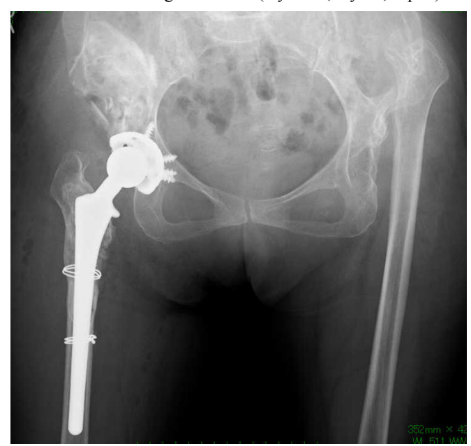
Fig. (3). An anteroposterior radiograph taken after the first revision surgery.

surgery, she underwent irrigation and debridement for an infected right revisionTHA due to Staphylococcus caprae . The infection was not controlled, and two-stage revision surgery using a cement mold including antibiotics was performed to treat the infected revision THA. The femoral component was changed from a PerFix-HA Mid Size Stem to a Per-Fix HA Long Size Stem (Kyocera, Kyoto, Japan).