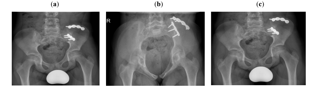
Fig. (3). Anteroposterior (a), inlet (b) and outlet (c) radiographs of the same patient at four months postoperatively.