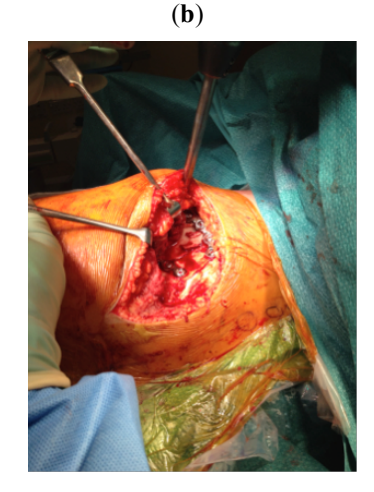
Fig. (2). Intraoperative photographs showing the fracture of the left iliac wing before (a) and after (b) the application of the two reconstruction plates. The patient's head is on the right. The circles on the bottom of the screen represent the PSIS and the lateral transverse process of L5. Note the curvilinear incision for the approach to the iliac wing.