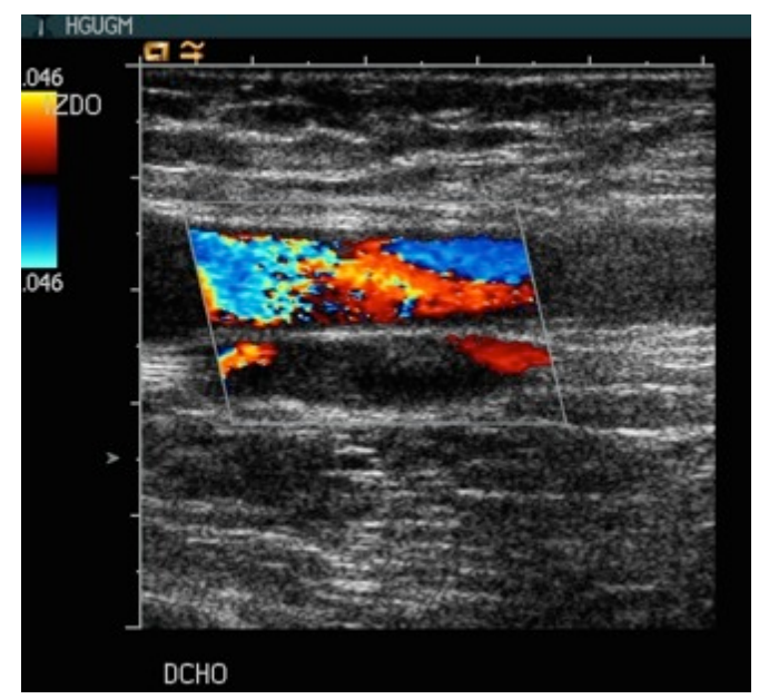
Fig. (1). Color doppler ultrasound exam of a patient with acetabular fracture. Bilateral acute thrombosis of common femoral and deep femoral veins.

a state of hypercoagulability, being the most important factor in the development of acute DVT the imbalanced activation of the clotting cascade. Tissue factor and markers of thrombin generation increase after a major trauma, while the endogenous anticoagulants (i.e., antithrombin III) show a tendency to be decreased.