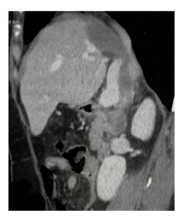
Fig. (4). CT scan: An involuted liver hydatid cyst.