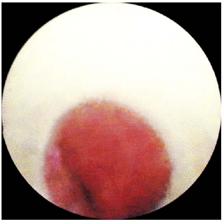
Fig. (3). Spyglass image: Infiltrated aspect of the mucosa with narrowing of the bronchial lumen is seen at the end of the guide sheath. Transbronchial biopsy and cytology brushings confirmed adenocarcinoma of the lung.

Characteristics and results for each individual subject are shown in Table 1. p-EBUS samplings were diagnostic in 7/15 of cases (46%).